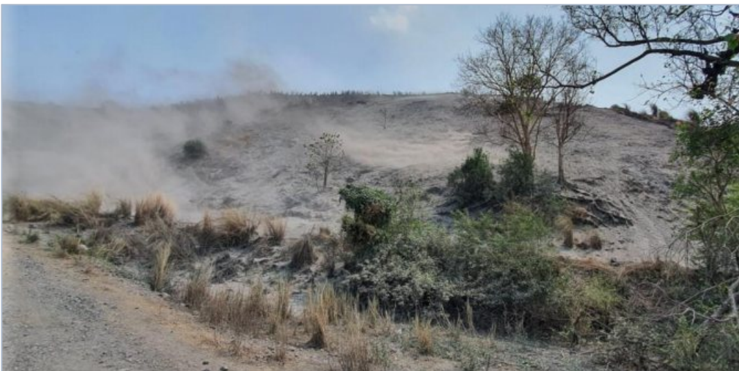
The environmental problems in Fly ash dumpsites