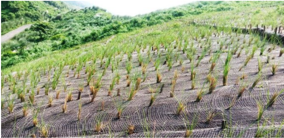
Vetiver plant growth on bioengineered fly ash mount