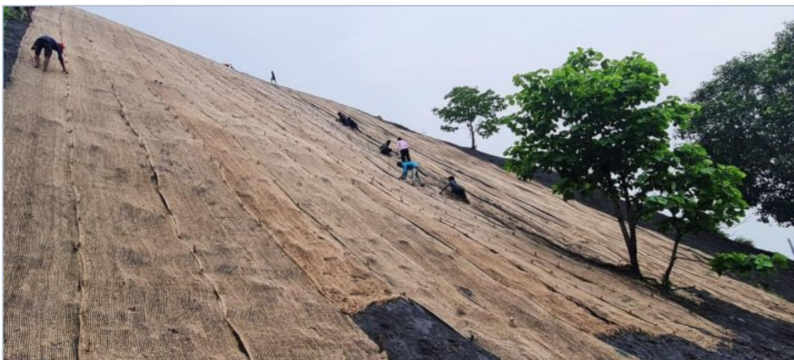
Laying of Jute Geotextiles and fixing with Bamboo pegs