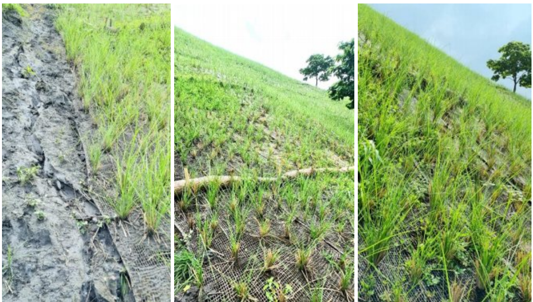
Vetiver plant growth in 2 months