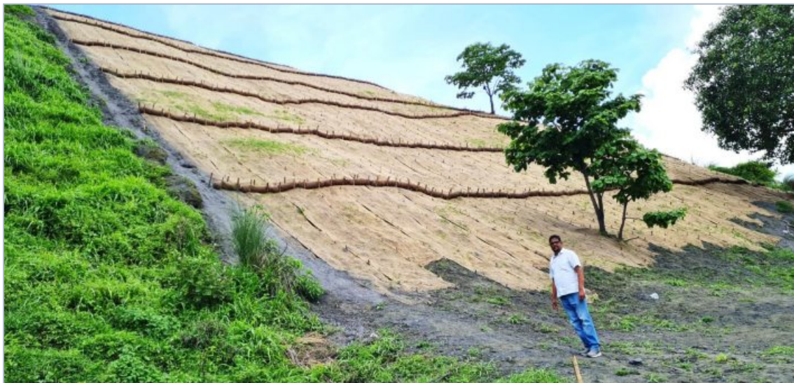
Fixing of Jute geotextiles & Coir logs for ash sliding control and compaction of site for plantation