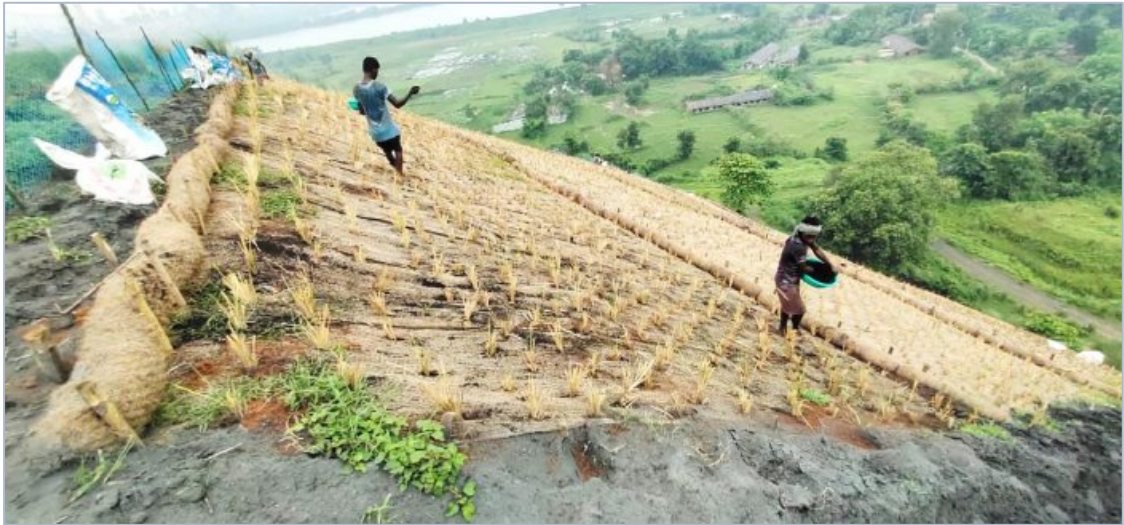
Plantation on compacted Jute geotextiles mulched area