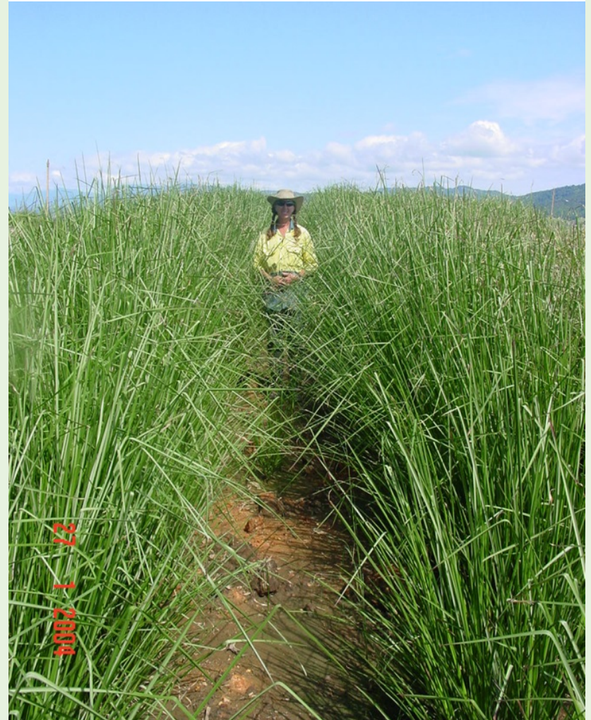
Eleven months after planting