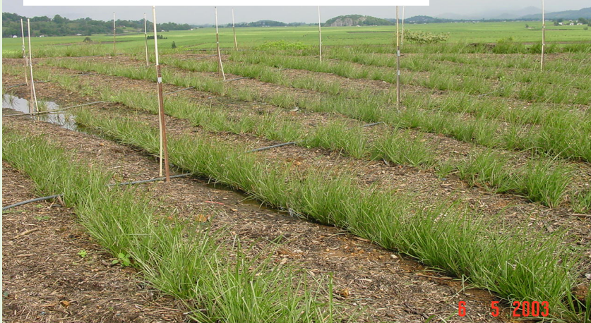
3 months after planting