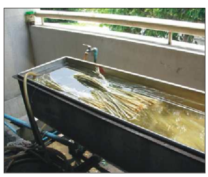
22. Soaking in water for 6 hours