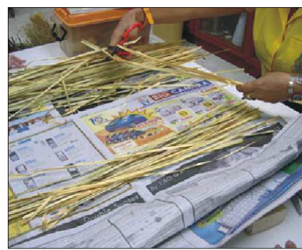
2. Sizing the Vetiver