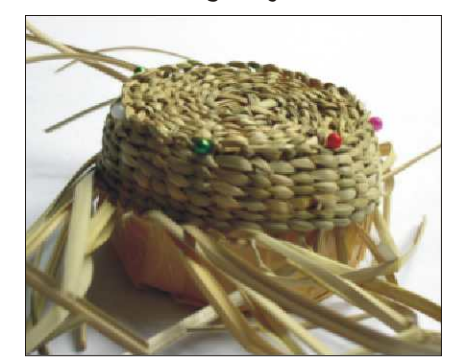
15. Turning the edge