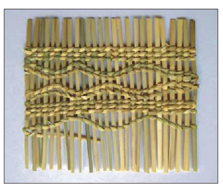
7. The first pattern