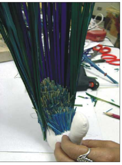
28. The peacock gets its plumage