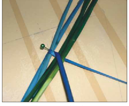
5. Starting on the basic weave