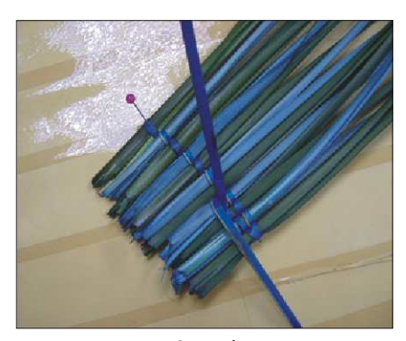
6. Starting a new row