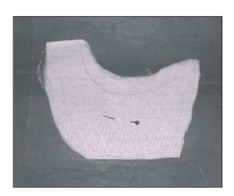
26. The animal form in fabric