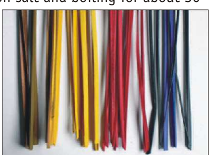
25. The dyed Vetiver leaves

tackle the blue, Rashmi works with yellow.