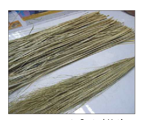
1. Sorted Vetiver