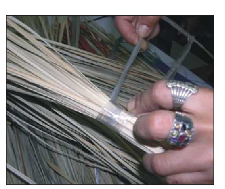
21. Making bundles