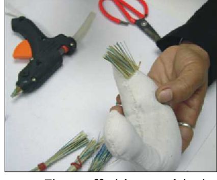
27.The stuffed inner with the Vetiver leaves glued on