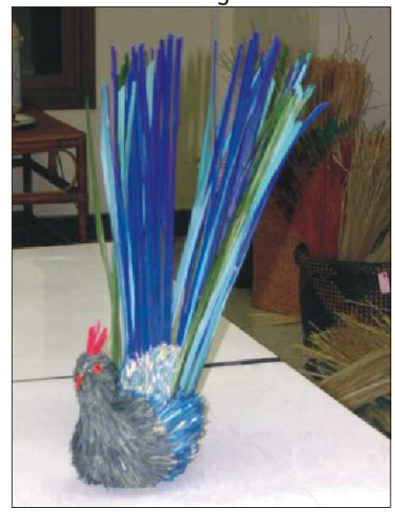
29. The finished peacock