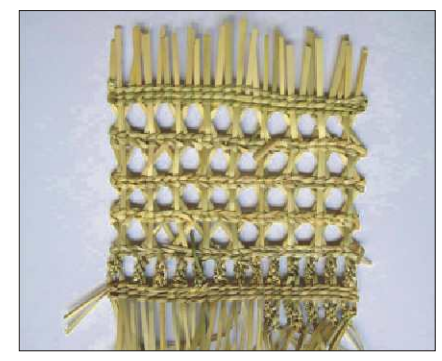
11. Fourth pattern