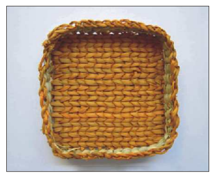
17. The finished coaster