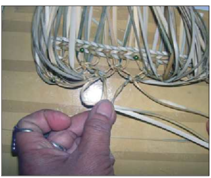
8. Starting the second pattern