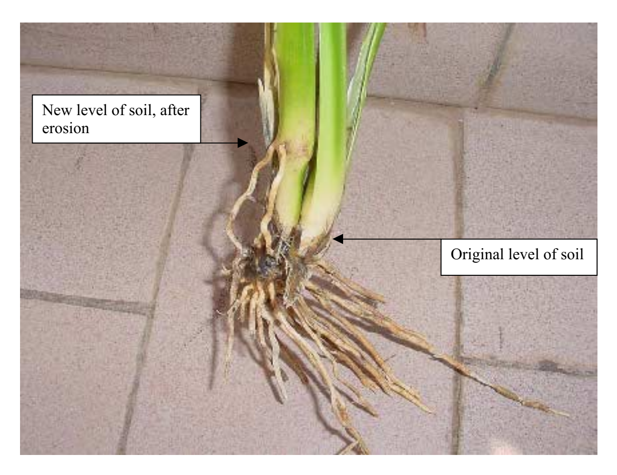
v. zizanioides: growth of new roots on stem 3 months after planting and an accumulation of eroded soil (on the left side of plant)