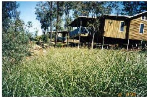
Eighteen months after planting, a fully functional and sustainable effluent disposal system

Recently a project was carried out to demonstrate and to obtain quantitative data on the effect of VS in reducing the volume of effluent and also in improving its quality under field conditions. This project was conducted at the Beelalong Community Farm in Brisbane, Australia, where VS was used to dispose the discharge from a septic system on site.