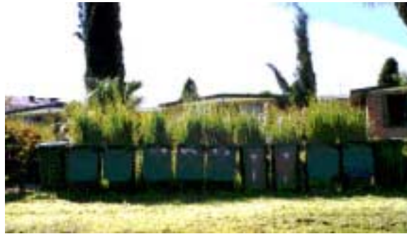
Set up of the field trial of the hydroponic system in 200L containers

Due to the success of the preliminary trial a field trial is now being carried out at Jacaranda motel just north of Grafton in northern New South Wales, Australia. This motel offers accommodation in 25 units and approximately 24,000 litres of sewage effluent is pumped-out each week from two septic holding tanks and taken from site at a cost of approximately $A14 000 yearly. It is anticipated that under the VS the cost of establishment would be about $A15 000 with annual maintenance and monitoring costs of about $A2 000. It is expected that these are one-off costs to provide solution to the long-term disposal problem.