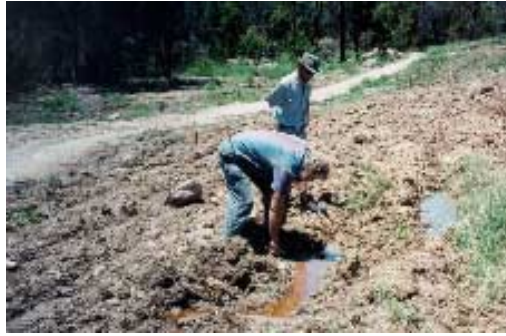
Leachate after rain on the side slope of an old landfill at Wellington Point near Brisbane, Queensland, Australia