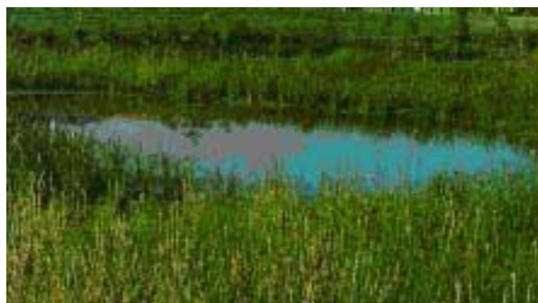
Vetiver in a wetland.