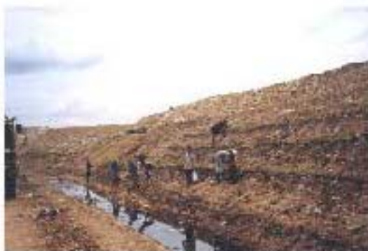
Leachate control trial on a large landfill site near Bangkok, Thailand

landfills. As there are currently 50 landfills in Thailand, findings from this research will have positive repercussion on measures to overcome this problem now besetting many communities worldwide (Hengchaovanich, 2000).