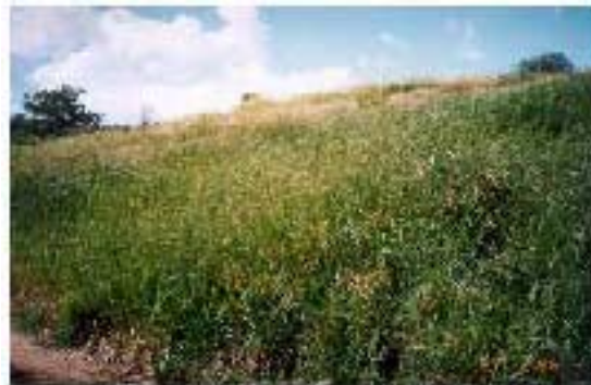
Vetiver was planted to absorb this leachate. Twelve months after planting, excellent growth, unaffected by heavy metals contamination in the leachate