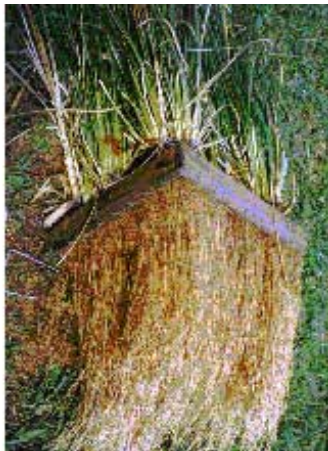
Massive roots, 780mm long, on a platform suspended in effluent.