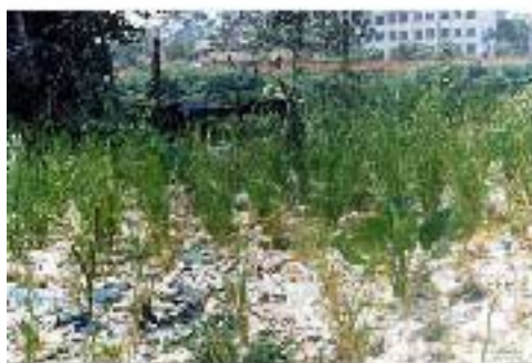
In Guangzhou, China, vetiver planted on a thin layer of topsoil on a fresh landfill site