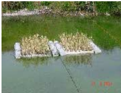
Newly planted vetiver on this floating platform. A trial is being conducted to determine the planting density needed to decontaminate this pond.