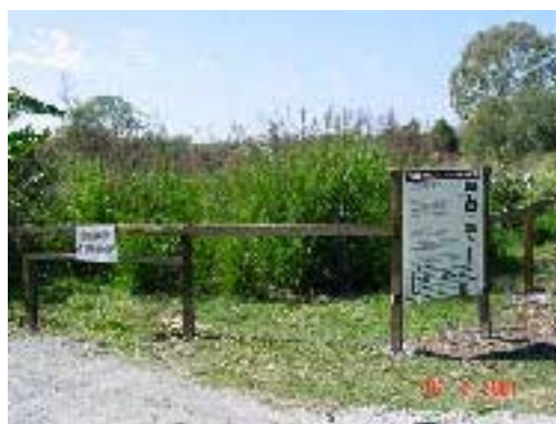
This stand of vetiver absorbed all the effluent discharge from the toilet. Note the luxuriant growth, 5 months after planting