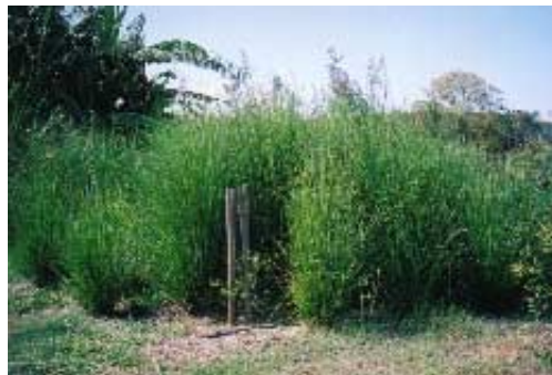
Four months after planting, vetiver grew vigorously in effluent loaded with nitrogen and phosphorus.