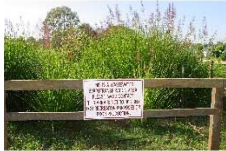
Six months after planting at an effluent disposal system with only 150 vetiver plants