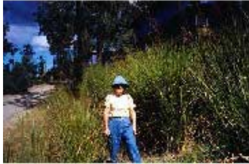
Eight months after planting, note the difference in growth between the top rows, which intercepted all the surplus effluent and leaving the lower rows deficient of water and nutrients.