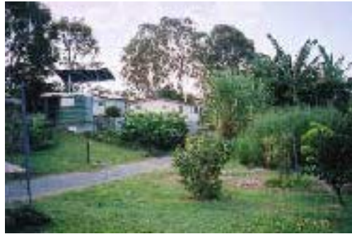
Vetiver was used to absorb effluent discharge from the septic system of this toilet at Beelarong Community demonstration centre at Morningside, Brisbane

The second phase of monitoring is now being carried out where nutrient load of discharge will be determined above and below the absorption area to demonstrate the efficiency of VS in decontaminating black water effluent (Hart, 2000b)