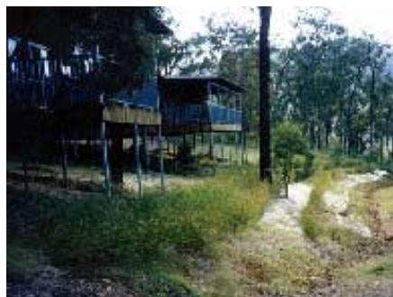
Eight rows of vetiver were planted to intercept surplus effluent discharge from a camp near Brisbane, Queensland, Australia

The result was completely unexpected as the first three rows of vetiver absorbed all the runoff, which previously ran down the slope. The absorption was so complete that while the first three rows had luxuriant growth, reaching almost 2m in eight months, the next five rows down the slope were less than 1m tall showing nutrient deficiency symptoms. This treatment has been very effective and stable in the last six years, the only management practice required is to cut and remove the top growth two or three times a year.