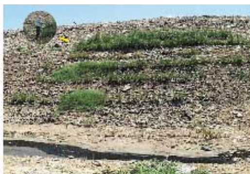
Good vetiver growth 5 months after planting