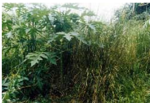
One year after planting