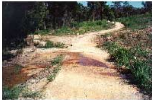
This leachate runoff is highly contaminated with Chromium, Cadmium, Copper, Lead and Zinc. It will eventually discharge into the nearby sea.