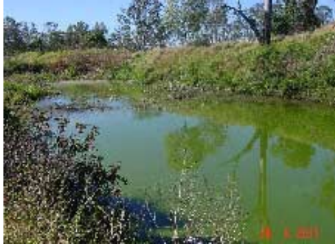
Water in this leachate pond was highly contaminated with Blue Green algae

Due to its superior absorption capacity of pollutants in wastewater, particularly N and P, investigations are underway in Australia to develop practical methods of control algal blooms in wastewater storage dams.