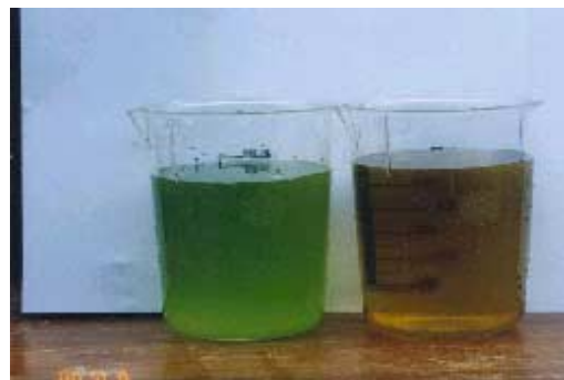
Left: Sewage effluent infested with Blue-Green algae due to high Nitrate (100mg/L) and high Phosphate (10mg/L) Right: Same effluent after 4 days treatment with vetiver, reducing N level to 6mg/L (94%) and P to 1mg/L (90%)

To determine the efficiency of vetiver grass in improving the quality of domestic effluent, a hydroponic trial was conducted using a mixture of black water (from toilet septic tank) and grey waters (from kitchen and bathroom). Results shown in Table 3 confirmed Chinese research in that vetiver could remove most soluble N and P in effluent over a very short period of time and thus eliminating blue-green algae in the polluted water.