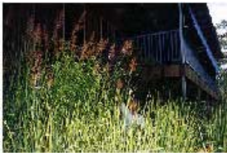
Sixteen months after planting, note the poor growth and N deficient vetiver in the foreground as compared with excellent growth of plants from the top rows