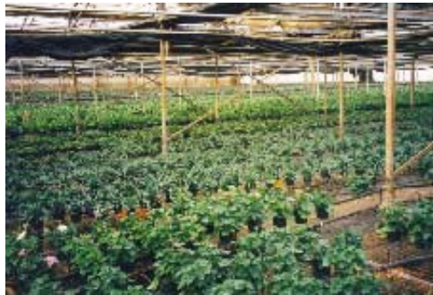
The plants in this very large nursery near Brisbane, are intensively irrigated and fertilized by overhead sprinklers, resulting in large volume of nutrient loaded effluent

Based on the use of sub-tropical pasture grasses, it was estimated that an area of at least 1500 square metres was needed to dispose the effluent generated by this nursery. As an initial trial, an area of 320 square metres was planted with vetiver at the density of 8 plants per square metre. Under the rich source of nutrient and plentiful supply of water, vetiver reached the full size of over 2 metres in height after 5 months and to the great delight of the nursery manager, this area of vetiver could absorb all the effluent generated by this nursery, even during the rainy season. Now in its third year, the VS is working in full efficiency and no further planting is needed. The only management required has been cutting and removing the top growth 2 or 3 times a year.