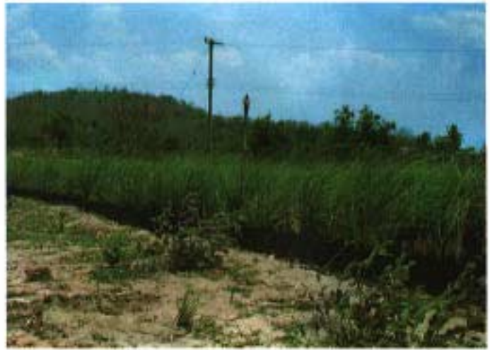
Vetiver tillers planted in large polybags for multiplication