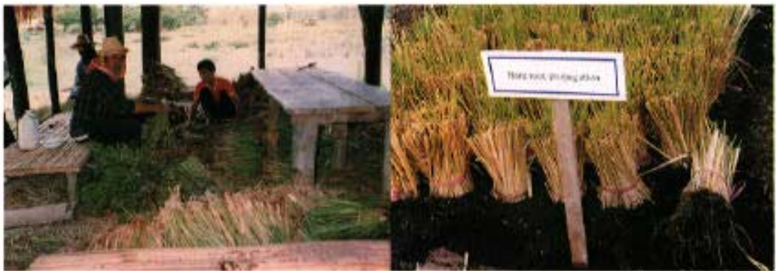
Preparing tillers for propagation/multiplication by trimming the roots to 5 cm and shoot to 40 cm