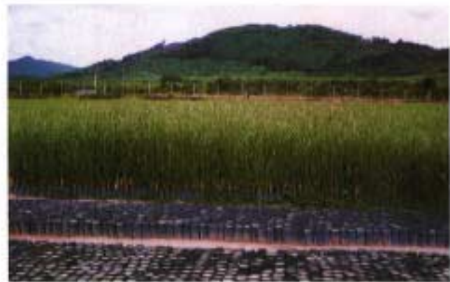
Polybags filled with planting medium (foreground) and those planted with vetiver tillers ready to be transplanted