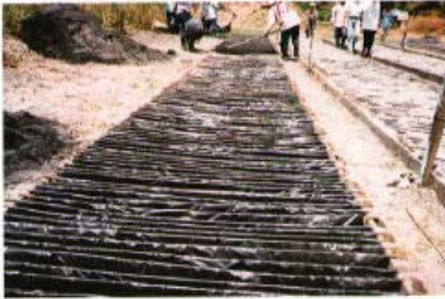
Preparing beds for strip planting using bamboo poles placed 10 cm apart and lined with plastic sheet