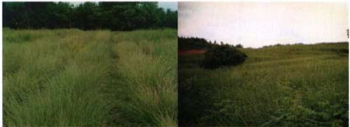
Bare-root tillers planted on the upland fields for multiplication