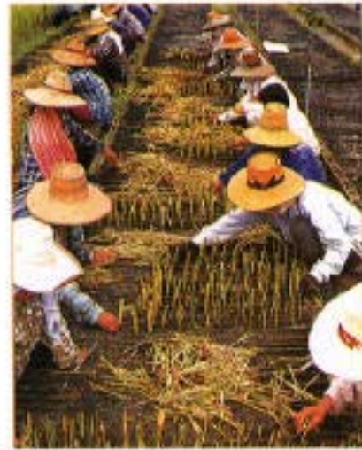
Planting bare-root tillers in prepared beds