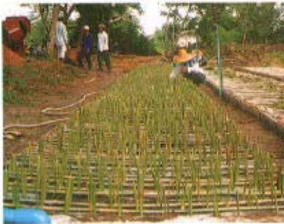
A view of vetiver propagating plot with sprinkle irrigation