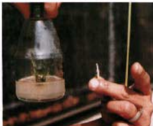
Explant (young inflorescence) held in fingers and tissue-cultured plantlets grown in the bottle