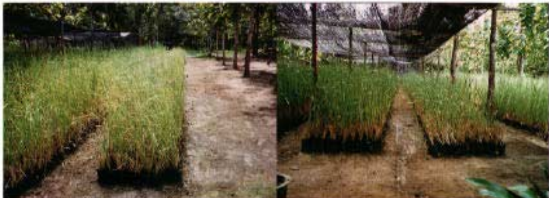
A nursery for polybag propagation