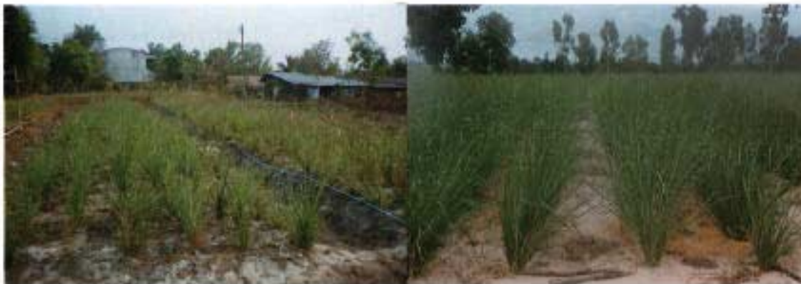
Planting bare-root tillers on raised beds for multiplication