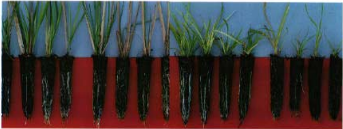
Vetiver grown for 8 weeks in dibbling tubes; removed from dibbling tubes to show medium held by root mass Above - with medium, Below - medium removed; Left - bare-root tillers, Right - tissue-cultured plantlets