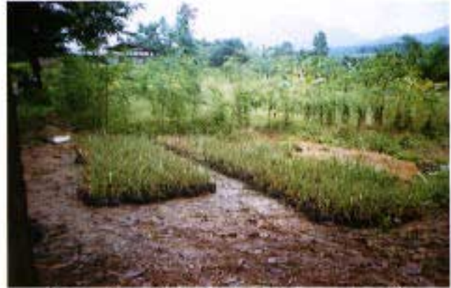
Vetiver tillers planted in the polybags ready to be transplanted in the field