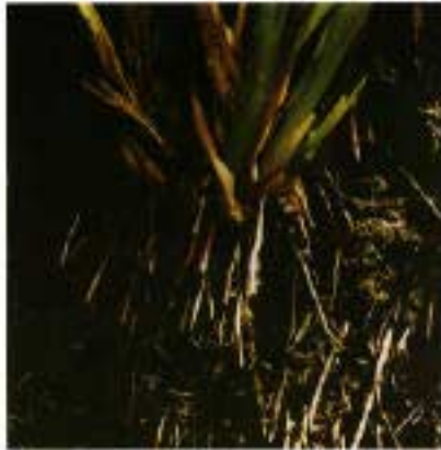
A clump showing its numerous roots and tillers developed from the base of the stem