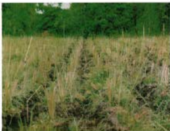
Planting bare-root tillers in paddy field