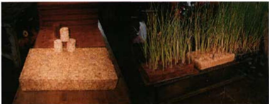
Biodegradable nursery blocks made of vetiver biomass. Vetiver tillers planted in biodegradable nursery blocks Pots made from vetiver biomass can be used as containers to grow vetiver tillers