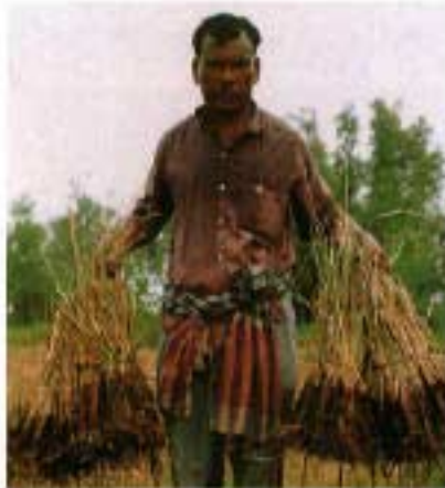
Bare-root tillers ready to be planted directly in the field