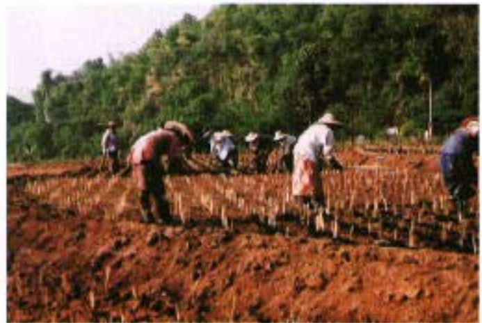
Planting bare-root tillers directly in the field for multiplication