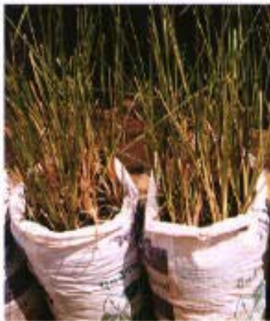
Used fertilizer bags can also be used