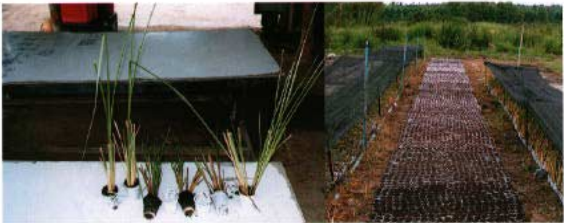
Soft drink cups can be used as containers for vetiver propagation (as used by a school project)