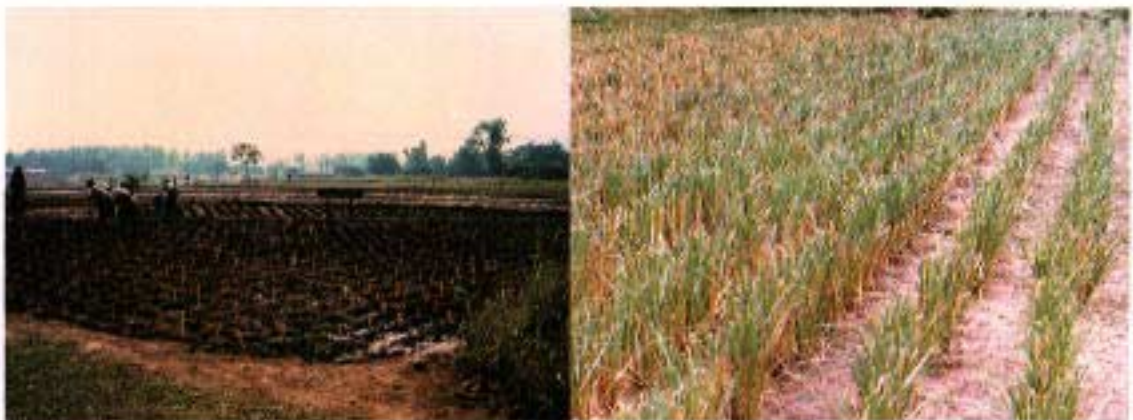
Planting specially-treated bare-root tillers directly in the field for multiplication