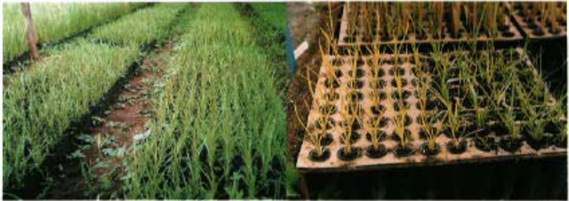
Vetiver plantlets transplanted into small polybags