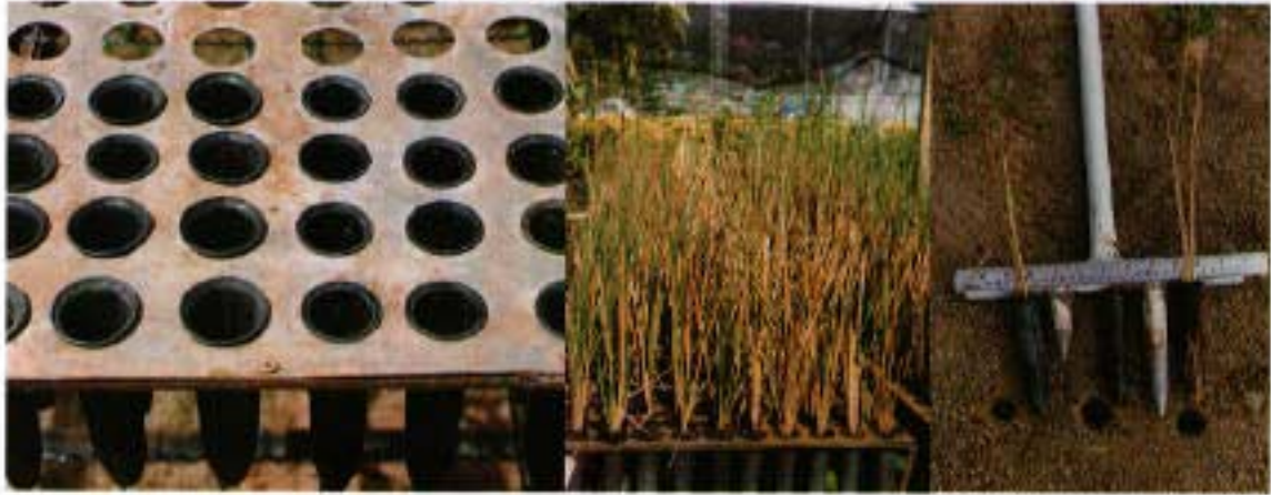
Aluminum tray to hold 80 dibbling tubes