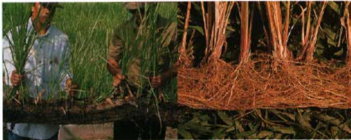
Strip with medium removed to show root development