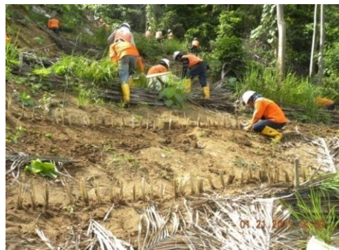
Photo 22: Vetiver application at PT Meares Soputan Mining, Toka Tindung gold mine site