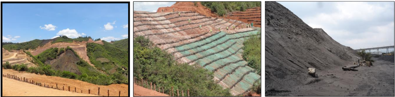
Ambatovy Project in Madagascar and Chromium Mine, Rustenburg, South Africa

More recently, mine rehabilitation and associated projects have been conducted in Madagascar (Ambatovy Project) and Xstrata Chromium Mine, Rustenburg, South Africa (Noffke, R. 2013).