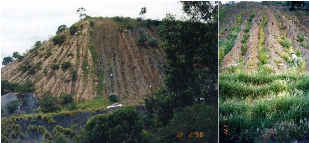
This coal mine waste dump was barren for 50 year. Before and after vetiver planting for erosion control

The overburden of open cut coalmine is generally highly erodible. These spoils are usually sodic and alkaline. Vetiver has established successfully on these soils and stabilised the spoil dump with slope higher than 45 0 and promoted the establishment of other sown and native pasture species.