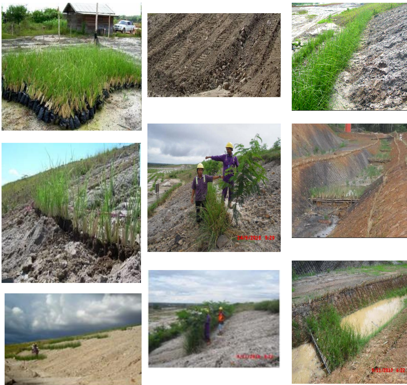
Photo 21: Vetiver system application at PT. Adaro, Kalimantan