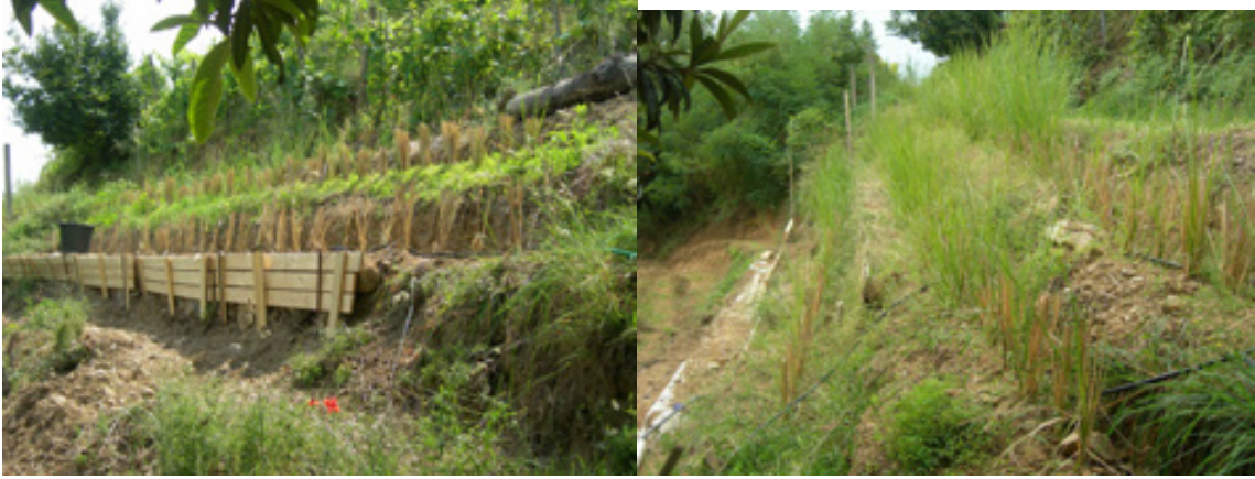
Rossi Vineyard Protection – last image two years after planting.