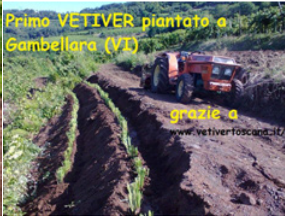
This is a work of an access road to a vineyard not far from the Rossi property – Massa Carra.