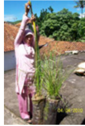
16 weeks old, about 155 cm leaf high