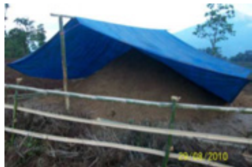
The manure ready to use