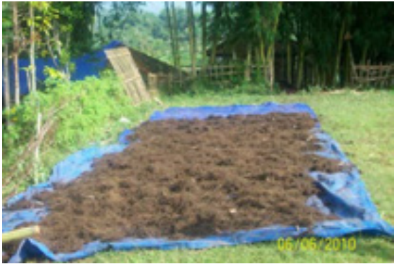
Vetiver root residue (waste) is a raw material of manure, It's to reduce enviromental problem