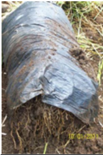
Vetiver root, 7 months, 75 cm long