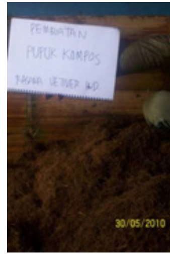
Ready to use