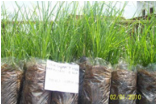
7 weeks old