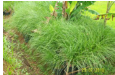
Another big polybag