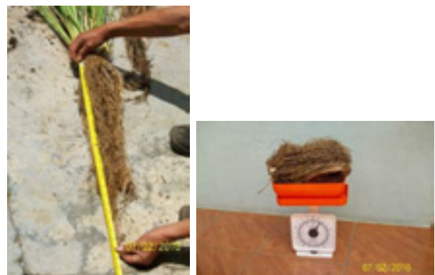
The roots. 8 weeks old, 60 cm long and 0.04 kg