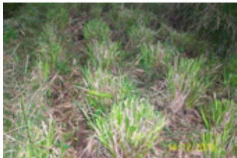
Big polybag maintenance, 6 months old