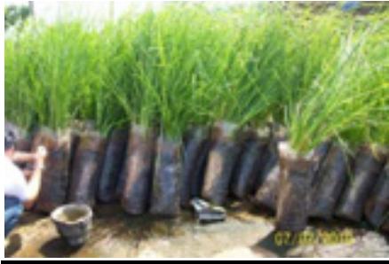
8 weeks old