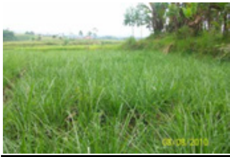
Big polybag,10 weeks old