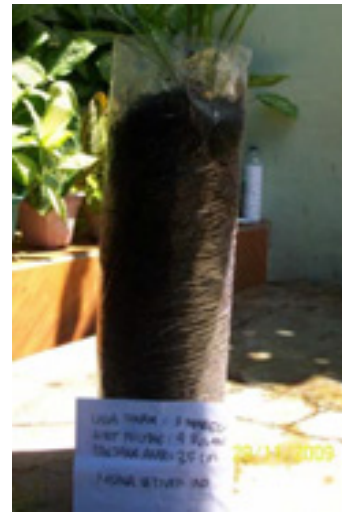
3 weeks old, 35 cm root