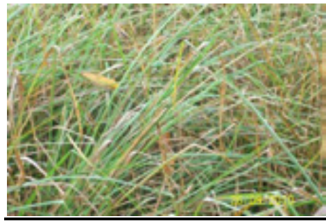
Vetiver leaf , 6 months old