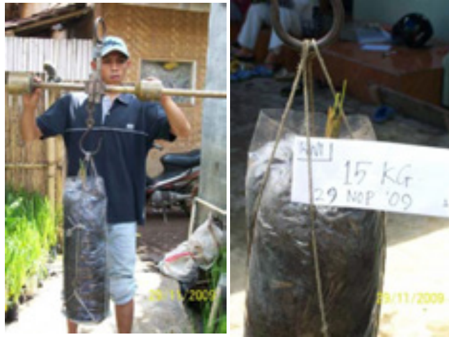
Big Polybag 30 cm diameter, 60 cm high, vetiver root residue as a media mix with soil, it's 15 kg