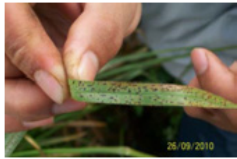
Vetiver leaf condition , 6 months old