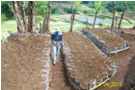
Vetiver on big polybag for production. It's 50-70 cm diameter and 60-80 cm high