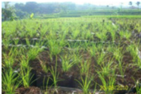
Another big polybag