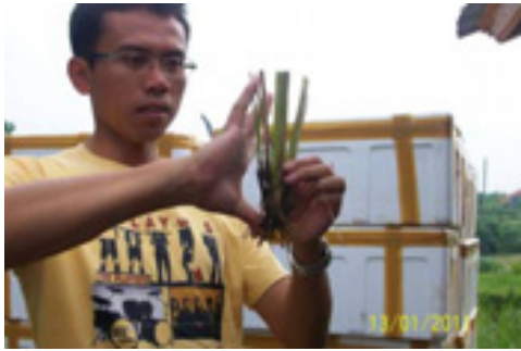
Prepare vetiver slips