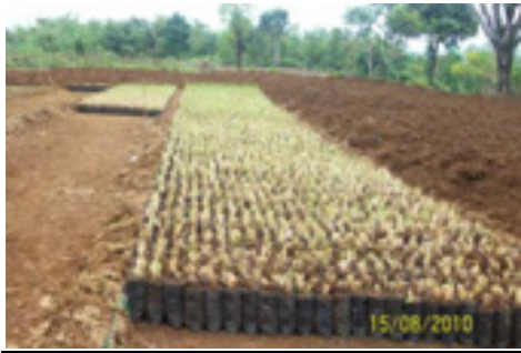
Vetiver on small Polybag for seed. It's 5-10 cm diameter and 20-25 cm high