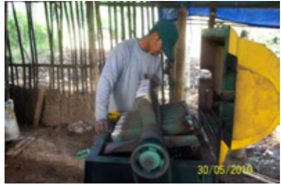
Chop up residue of vetiver root