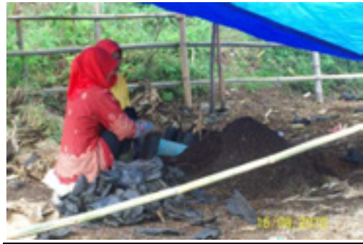
Product vetiver polybag