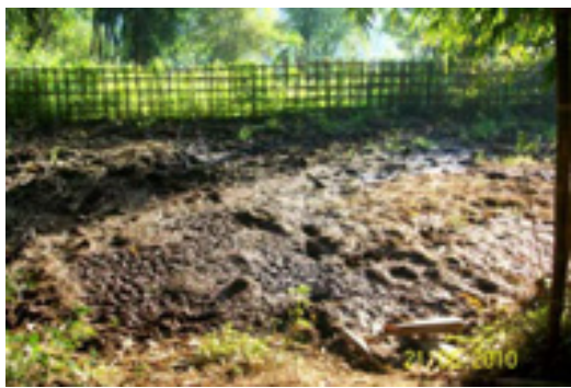
Vetiver residue mix with cow/buffalo manure