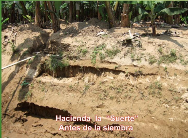
Hacienda la "Suerte" Antes de la siembra