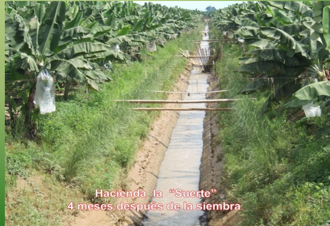
Hacienda la "Suerte" 4 meses después de la siembra