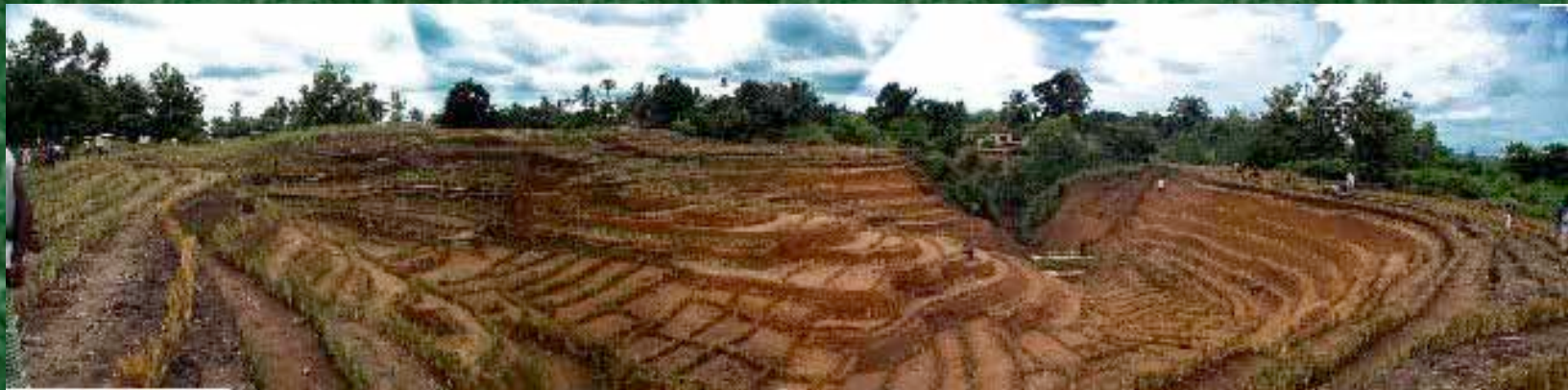
Panorama of entire site after planting