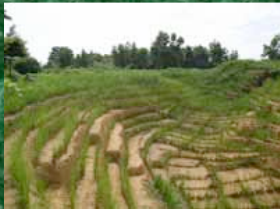
Two months after planting