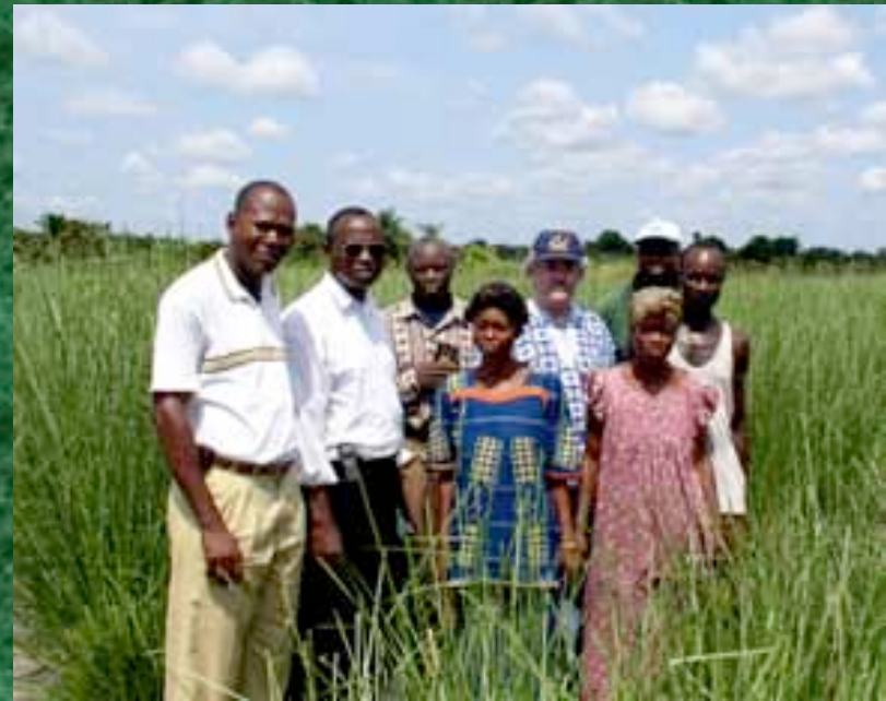
Vetiver nursery owned by a womens association in Kikwit