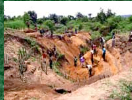
Beginning to make the benches