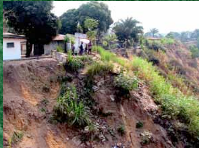
Kinshasa home on the edge of huge ravine protected with only several meters of vetiver hedge

Positive social benefits are seen by communities only if we talked about income generation, food security and livelihood improvements such as road stabilization to better access markets