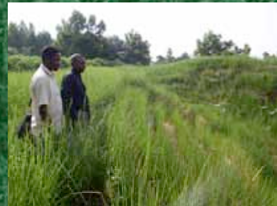
Four months after planting