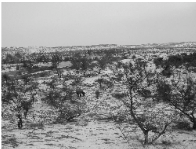
Photo 1 Typical coastal dunes with planted Casuarina in Central Vietnam

by sand dunes are now facing starvation, and have nowhere to go. In Da Nang during the last flood, farmers feared drowning if the dams breached.