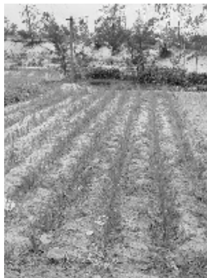
Photo 5 Very healthy nursery next to the dune

The nursery plants are very good, green, strong and straight, no dry leaf. Fertilizer was applied once (NPK + manure mix). Clumps have maximum up to 30 tillers, usually 10-20 tillers (Photo 7).