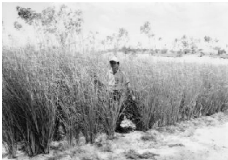
Photo 8 Excellent growth in nursery after 4 months

The nursery looks very good, green, strong and straight, no dry leaf. All are up to 1.5-1.7 m high. Many tillers have become mature with a lot of noded culms (Photo 8).