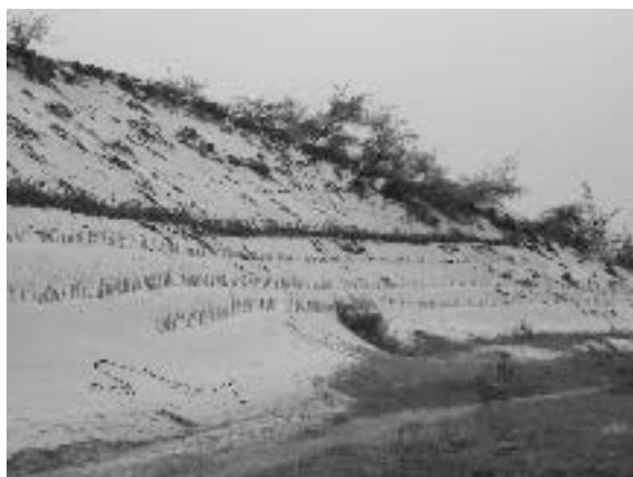
Photo 12 One month after planting

Initially the nursery had 14 rows, giving in total about 30,000 slips, sufficient for about 1.5-2 km planting. But due to the two incidents mentioned above 1000m were planted in October 2002 at three sites. This was at the beginning of the rainy season, one month later all the grasses established well (Photo 12).