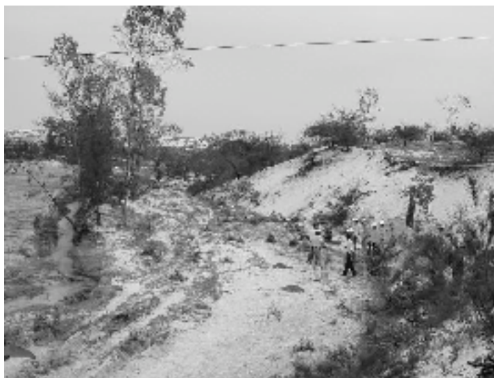
Photo 2 Overview of the riverbank on the left and the sand dike on the right before planting

Farmers have to protect their farmland against sand intrusion from the dunes and the dikes. The erosion was so bad that when it rains they even had to get up at night to guard the dikes (Photo 2).