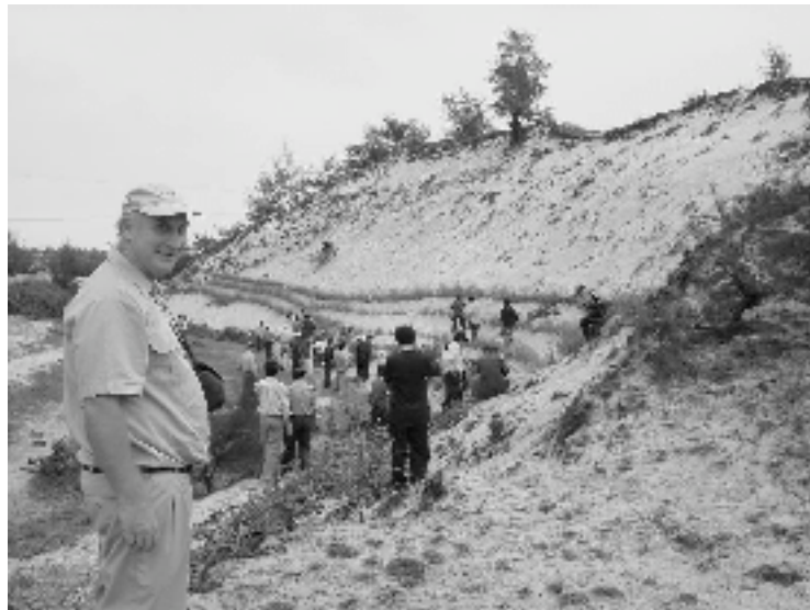
Photo 13 Participants inspected the new planting

The aim of the project was to investigate whether vetiver hedges could stop the stream from undermining the foot of dunes, which collapsed under heavy rains. The demonstration site was 11 months old and the large scale planting was 4 month. Participants observed that the planting of three horizontal hedges and some vertical ones, were effective in reducing the speed of water and stop erosion at the foot of the dune. Vetiver hedges were dense, closing all the gaps and that other vegetation established well between the rows. However, more research is needed to find out the optimal planting time, hence whether it may be possible to establish hedges without any watering.