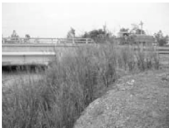
Photo 11 A well-stabilised bridge abutment on Highway 1 in Quang Binh province