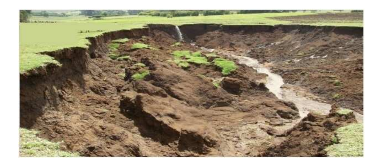
Figure 6: Effects of soil erosion in the study aria.