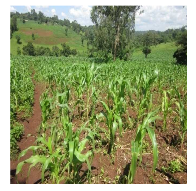
Figure 10: Maize Farm without VG, Tulube