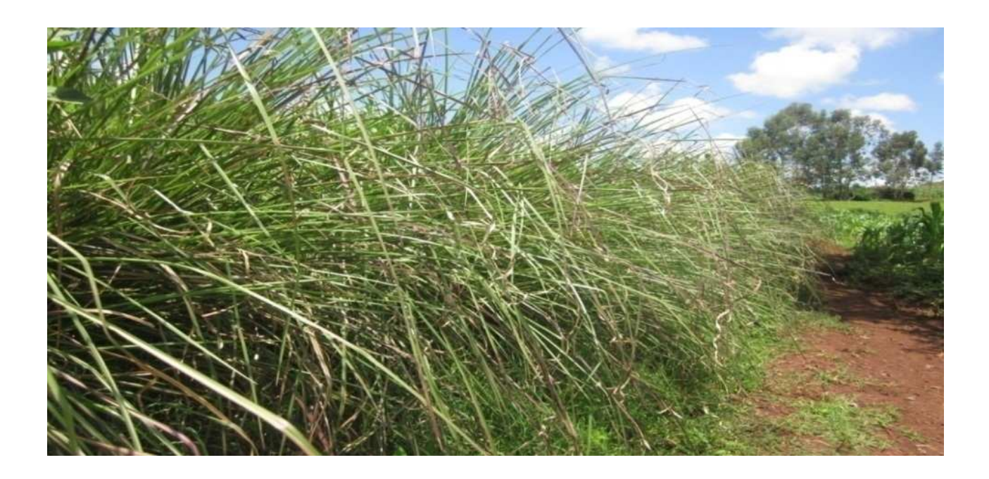
Figure 2: Vetiver grass hedgerow, Tulube.

Later in 2005, an NGO called Ethio-Wetlands and Natural Resource Association (EWLNRA) has launched the program on Vetiver grass hedgerows for soil and water conservation in the study area, Tulube Peasant Association (Metu District Administration Office, 2010). According to the research result, vetiver grass was effective both alone and/or combined with other traditional and modern methods of SWC (figure 2).