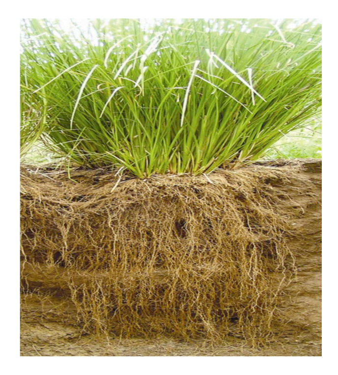
Figure 4 Deep massive and fiber vetiver roots, Tulube.

The other characteristic that was appreciated by farmers was its deep tough root. Vetiver's deep, massive and fibrous root system grows vertically deep into soil and forms a tightly knitted net and anchor a hedge firmly and binding the soil (Figure 4). This root system makes vetiver grass a unique and useful plant on earth.