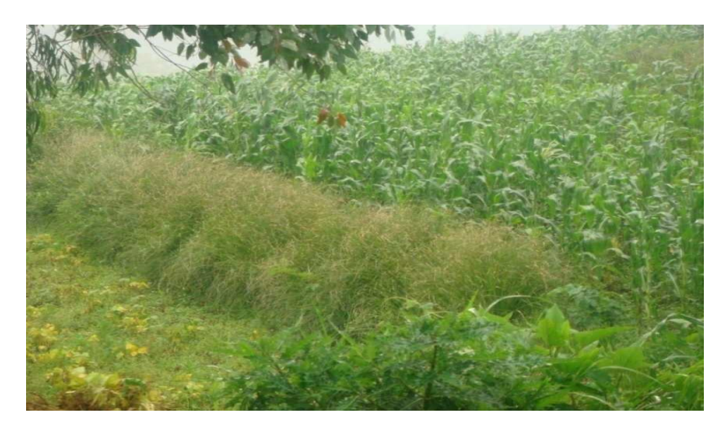
Figure 3: Highly denser vetiver hedges, Tulube.

According to this study, farmers preferred the bio-conservation measure because it forms a strong permanent hedge. When Vetiver grass was planted close in a row, it developed thick and highly denser hedges that intercept each other and form strong network. Once established, the hedges stayed long and needed only little maintenance. This strongly erected hedge slowed runoff and trapped crop residues and silts transported by runoff and, then, allowed sediments to stay on the site forming natural terraces (figure 3).