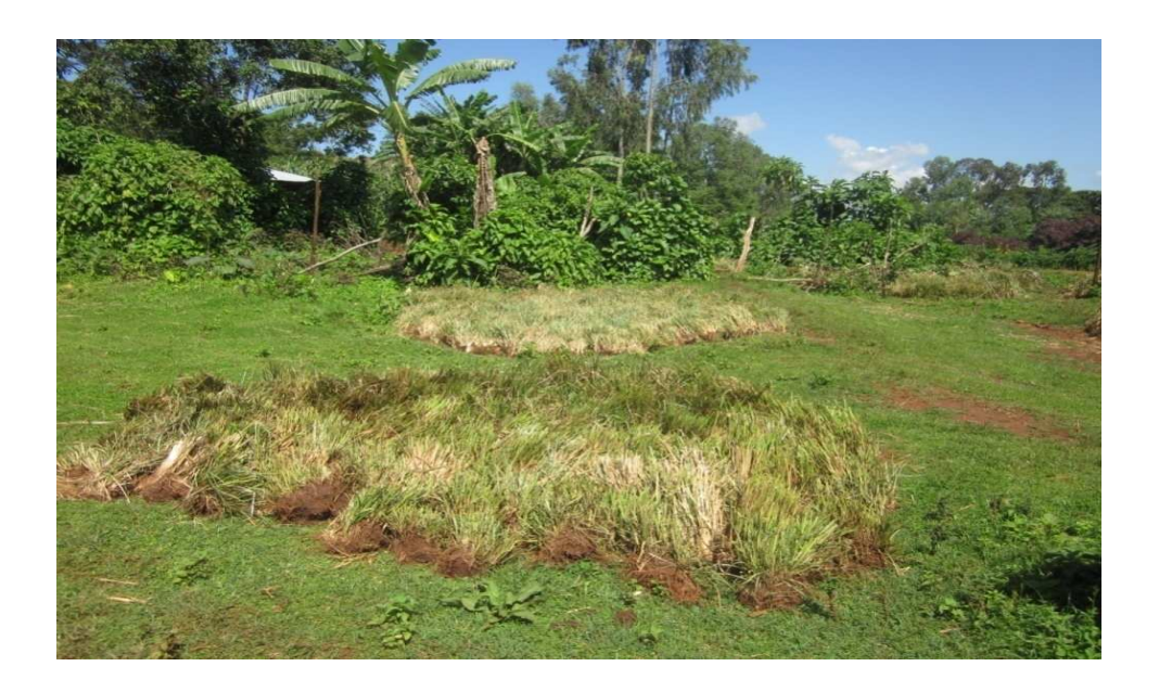
Figure 5: Vetiver grass clumps used for propagation in Tulube

Focus group discussion with sample farmers and Metu Ethio-Wetlands and Natural Resource Association Office indicated that Vetiver grass was planted on plot of voluntary farmers since 2005. Farmers first had prepared 50 to 70 meter long Fanya Juu terraces on their farmland and planted 700 to 1000 Vetiver grass tillers (shoots). It was also noticed that some farmers were planting Vetiver tillers without making Fanya Juu terraces to save labor and time. The study found out that once the farmers were supplied with the initial planting material, within short period they multiplied clumps from their plot for further expansion and sale.