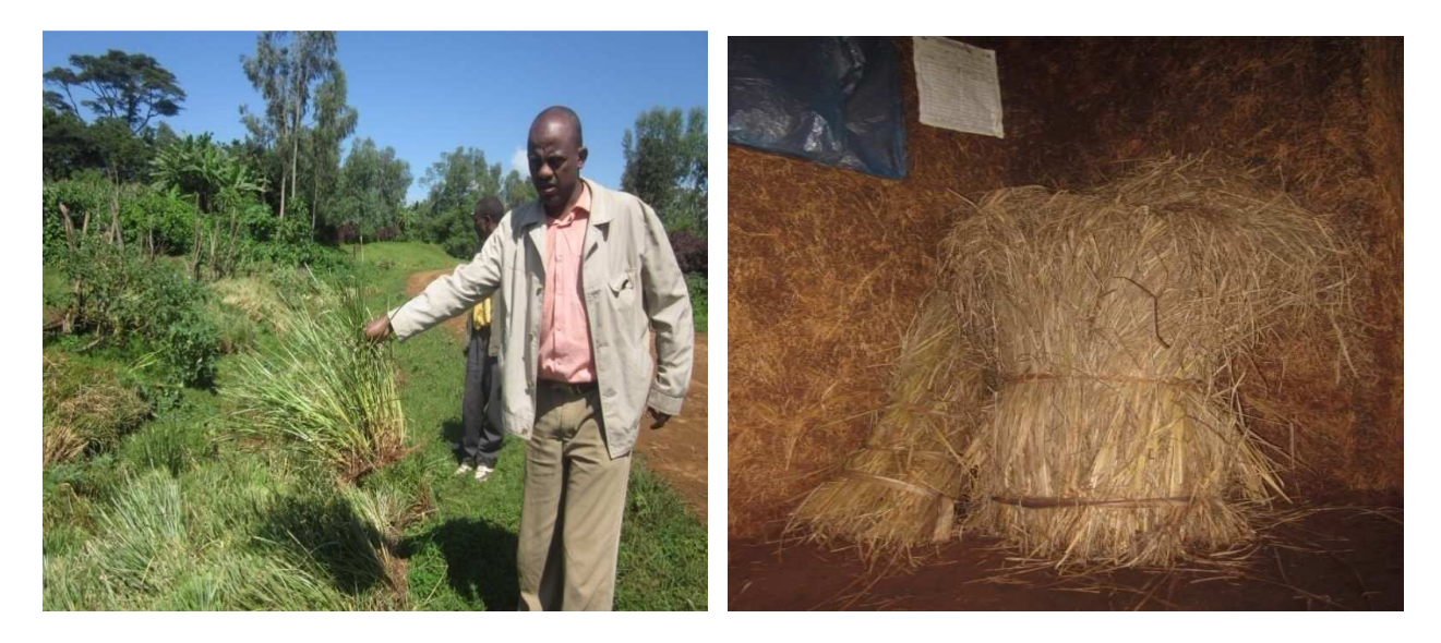
Figures 12: Vetiver clumps ready for Sale. Figures 13: Vetiver leaves ready for Sale.

increasing accordingly. This income generating has increased the acceptance and expansion of Vetiver grass in the area.