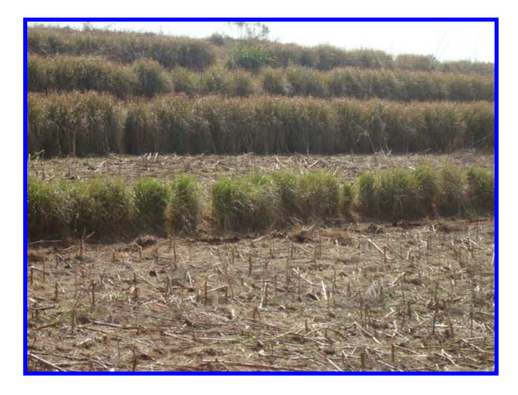
Figure: 11 Vetiver Grass Hedgerows on Farmland after Harvest, Tulube

The result of the study revealed that the sample households are using Vetiver leaves for house (21%), kitchen (66%), toilet (53%), grain bin or store (24%) and for beehives (16%) construction.