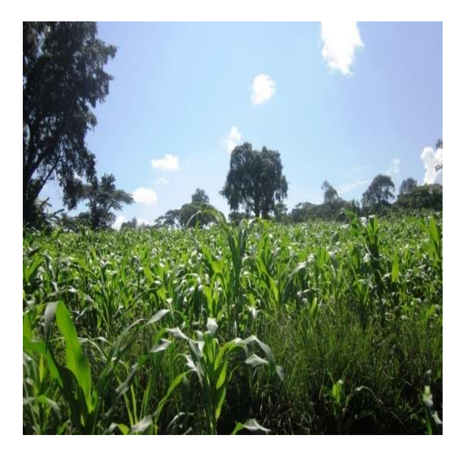
Figure 9: Maize Farm with VG, Tulube.

In addition, the study confirmed that the maize with Vetiver grass hedgerows was more green and grown better than the maize without Vetiver grass (Figure 9 and 10).