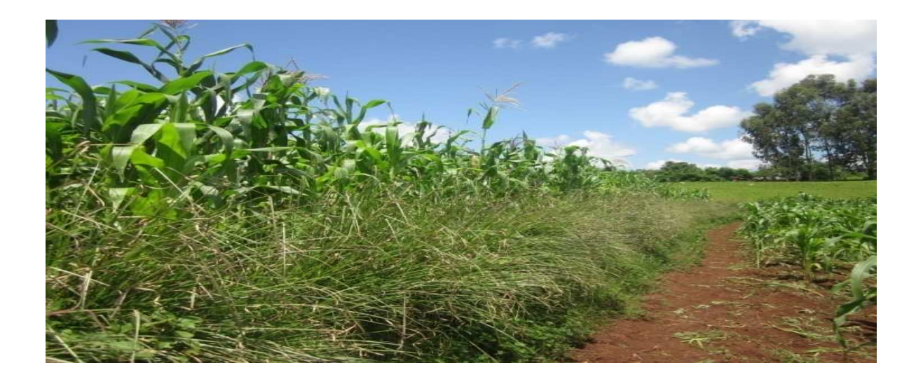
Figure 7: The Dense vetiver grass hedgerow on the study area farm land

All the Vetiver grass user households unanimously agreed that the Vetiver grass has a strong, deep and fibrous root that slowed runoff water and trapped sediment (Table 9). And it was acclaimed as the best on-farm erosion control method. The outcome of the focus discussion indicated that Vetiver was best and effective when planted in rows on sloppy farm lands and has been used successfully for flood and erosion control on the flood plains of the study area. All farmers appreciated the Vetiver grass capacity to reduce the velocity and distribute heavy runoff