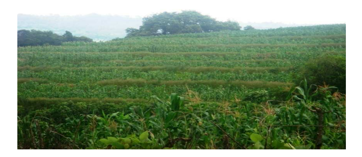
Figure 8: Vetiver hedgerows on Maize farm, Tulube.

As per the data in Table 10, majority of the respondents agreed that Vetiver grass was easy to implement (80%), easy for maintenance (82%), inexpensive (74%), and environmentally friendly (100%) for soil conservation measures in general and for slope stabilization in particular.