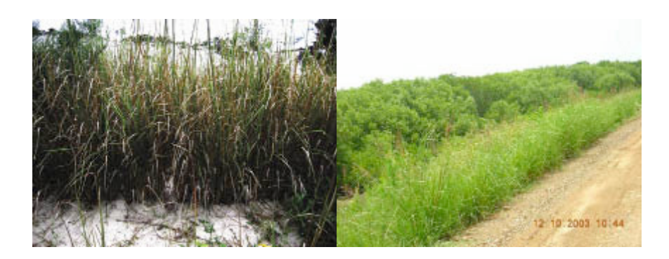
Photo 3: Vetiver on coastal sand dunes in Quang Bình (left), and saline soil in Gò Công Province (right) (Vietnam).

Photo 2: left: Vetiver grass surviving forest fire; right: two months after the fire (Australia).