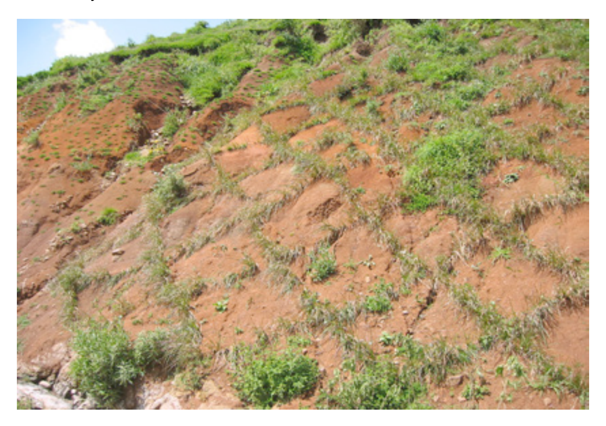
Photo 5. Applications of Vetiver grass for landscape stabilization (GTZ-IFSP/ South Gonder, 2005)

The grass has been used intensively for soil and water conservation and stabilization of steep slopes (Photo 5). The effects of Vetiver hedges in controlling flood water and soil erosion were studied at Jima Research Center (Tesfu Kebede and Tesfaye Yakob, 2009). The findings were successful in reducing flood velocity and limiting soil movement, resulting in very little erosion in the third year.