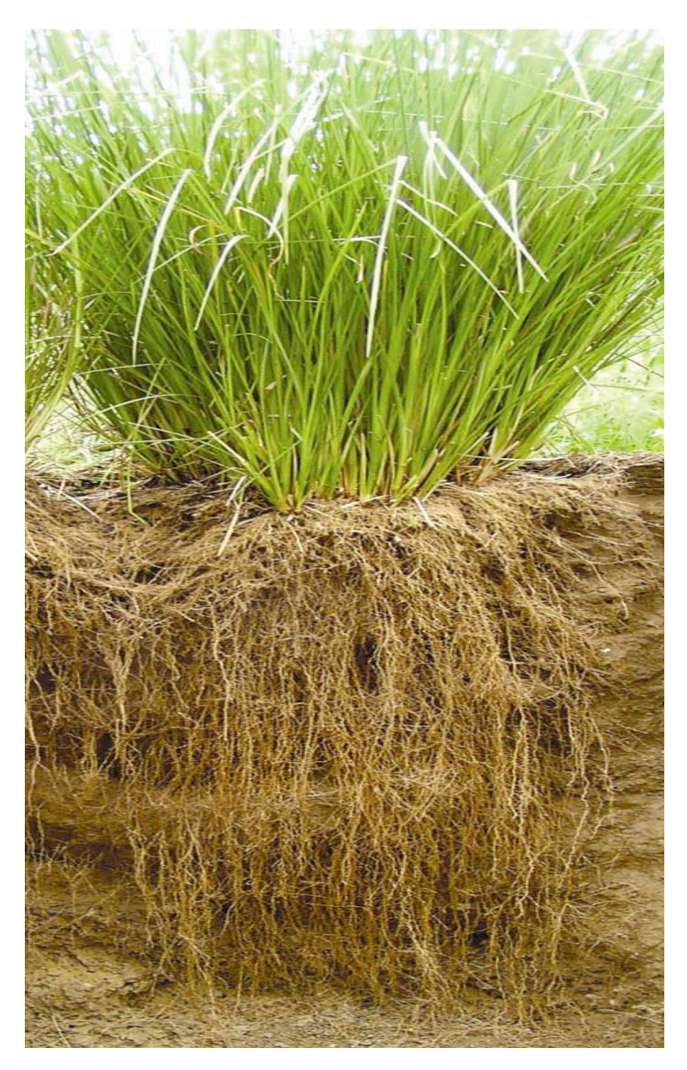
Photo 1: Erect and stiff stems form a dense hedge when planted close together. The roots could penetrate though the hard pan soil.

tool for other, non-agricultural applications such as land stabilization/reclamation, soil erosion and sediment control.