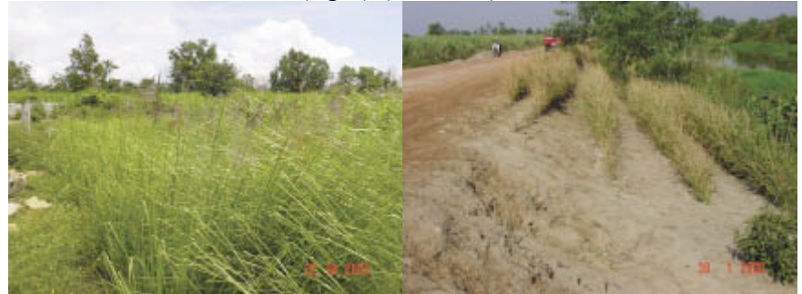
Photo 4: Vetiver on extreme acid sulfate soil in Tân An (left), and alkaline and sodic soil in Ninh Thuận (right) (Vietnam).

Photo 3: Vetiver on coastal sand dunes in Quang Bình (left), and saline soil in Gò Công Province (right) (Vietnam).