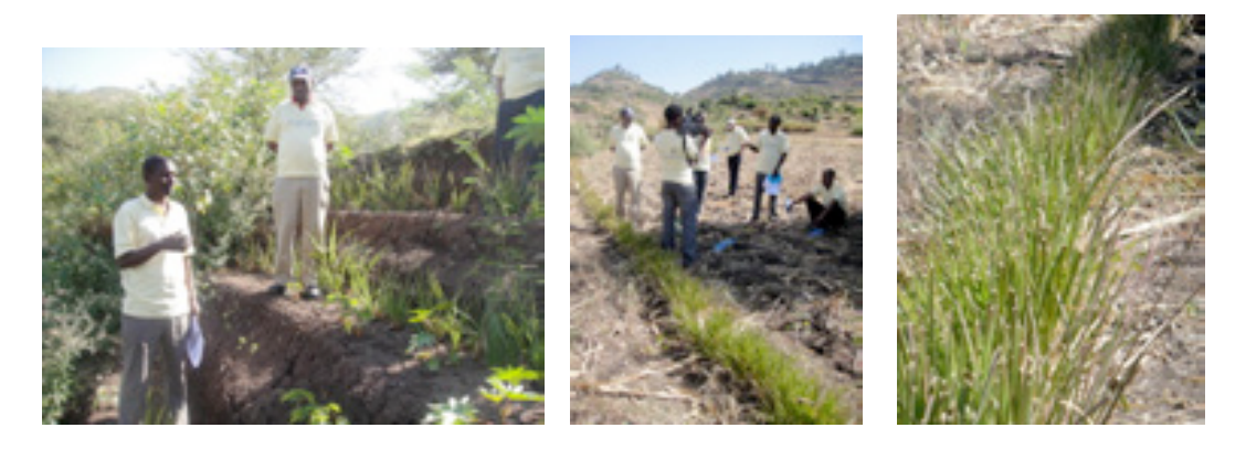
Photo 7: Vetiver application in gully treatment and soil and water conservation (Amhara region)