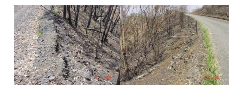
Photo 2: left: Vetiver grass surviving forest fire; right: two months after the fire (Australia).

Most varieties of Vetiver are naturally sterile hybrids and do not set seed, and because Vetiver does not produce stolons, there is no danger of the grass spreading from where it is planted.