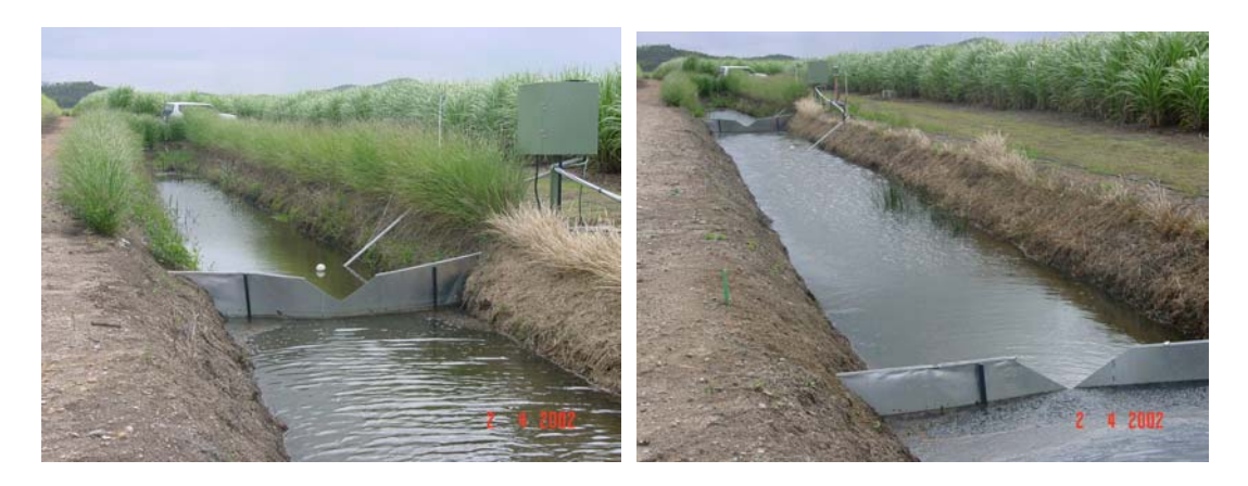
Fully instrumented experimental site with V notch weir to monitor volume flow. vetiver treated catchment LHS and control catchment RHS.