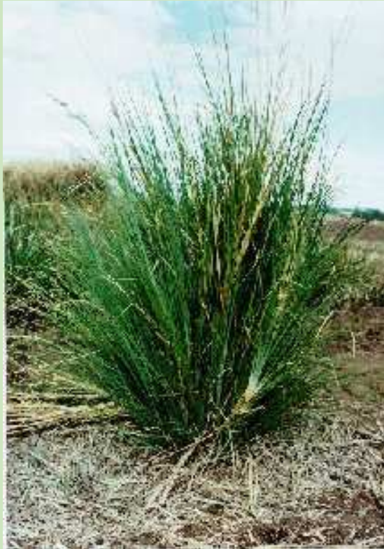
Australia - Queensland