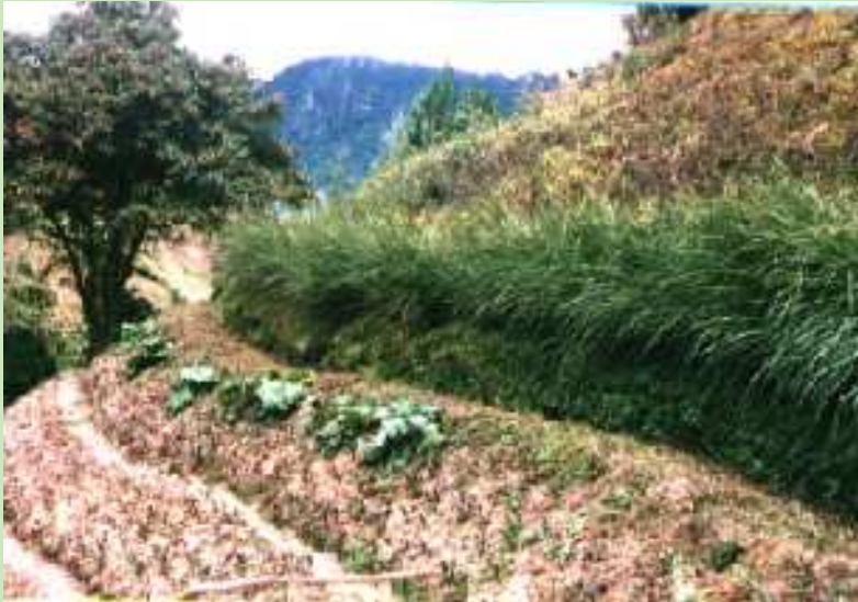
Panama - Vetiver hedge on a steep slope in Chiriqui