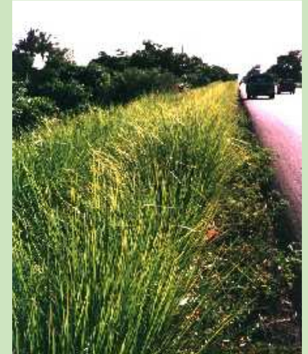
El Salvador - mature vetiver hedge protecting road embankment