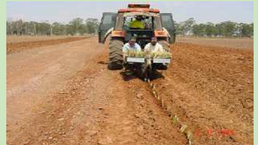
Australia - machine planting