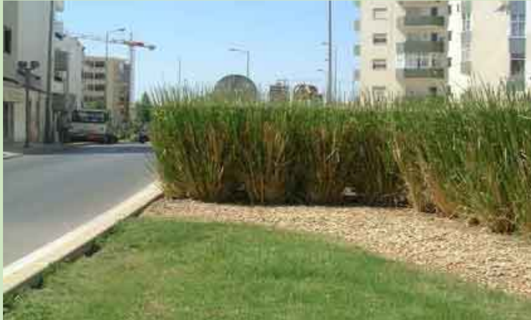
Portugal - Lagos. VS used to prevent head light glare from traffic on a divided road.