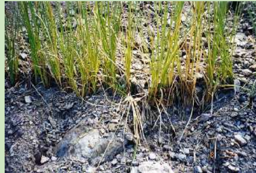
Venezuela - Rehabilitation of bauxite mine using Vetiver Systems