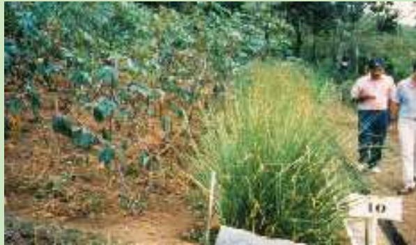
Columbia - CIAT vetiver - cassava trial on 12% slope