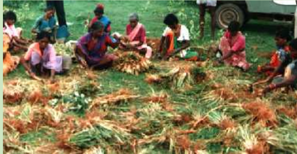
India - Preparing planting material