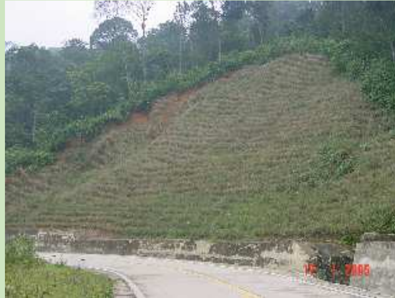
Extreme slope stabilization Ho Chi Minh Highway - Vietnam