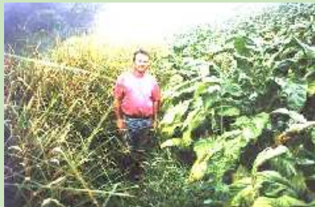
Costa Rica - vetiver protecting tobacco crop