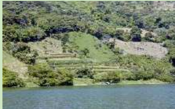
El Salvador - hillside conservation