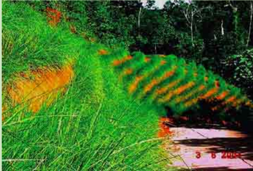
Australia - Stone quarry rehabilitation using Vetiver System