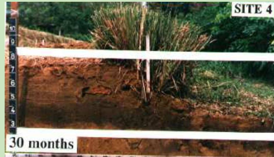
Malaysia - close up hedge cross section