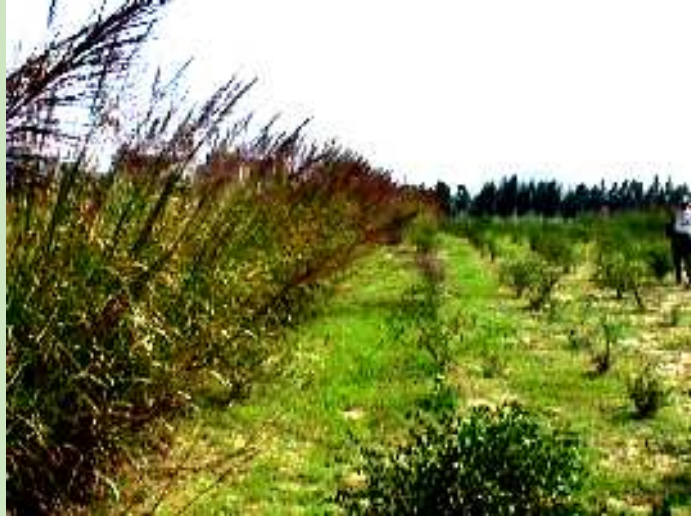
China - VS for wind erosion control and protection of young trees from wind damage