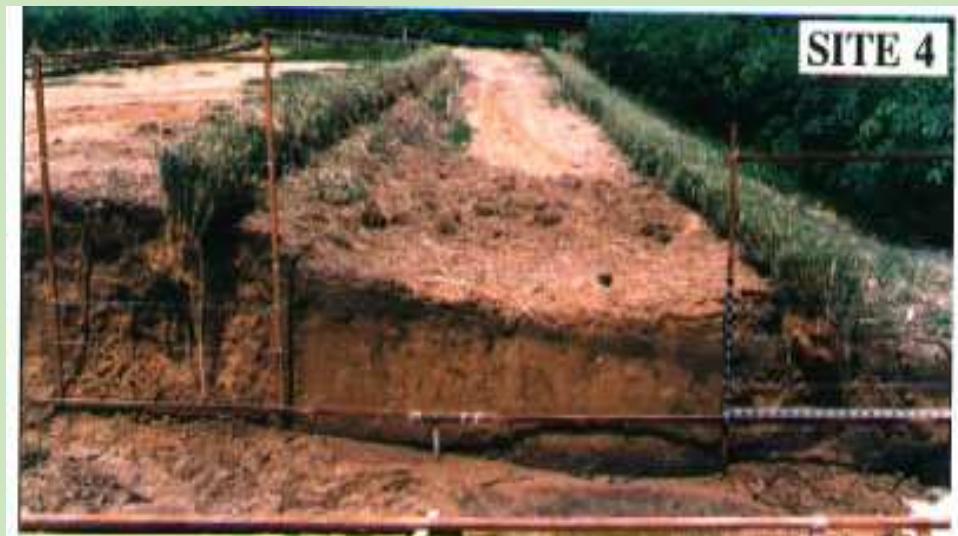
Malaysia - 30 month hedgerow planted on the contour

The basic technology comprises a hedgerow of vetiver grass planted on the contour