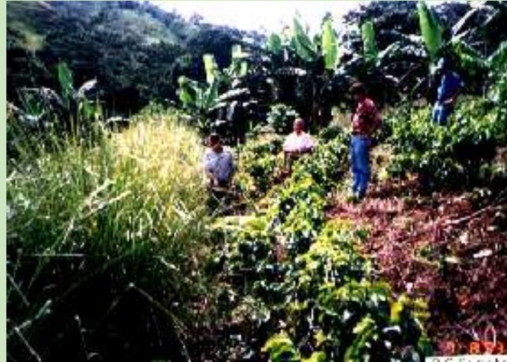
Costa Rica - VS for erosion on a steep slope coffee farm