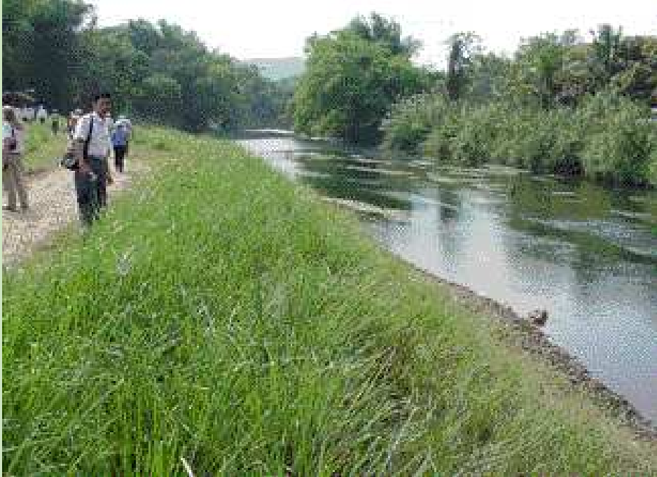
Thailand - River bank protected with Vetiver