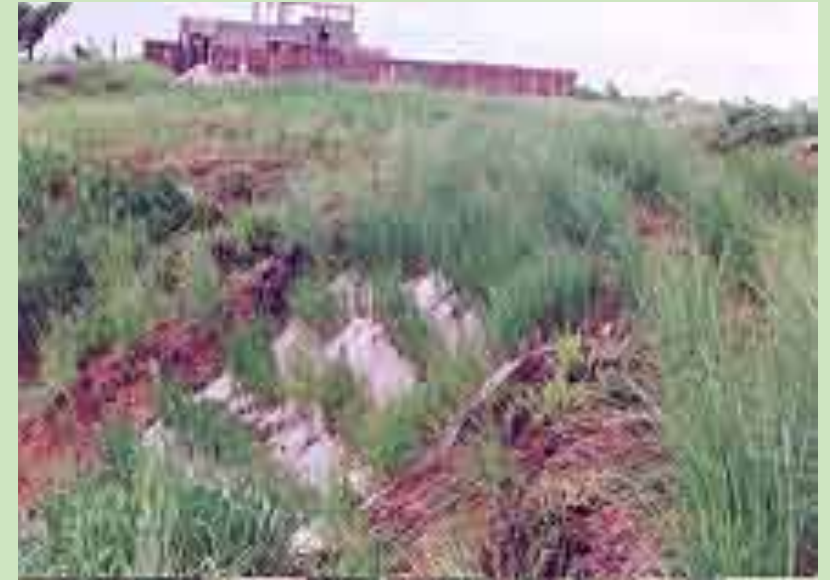
Mexico - Oaxaca. Stabilizing a cliff with vetiver