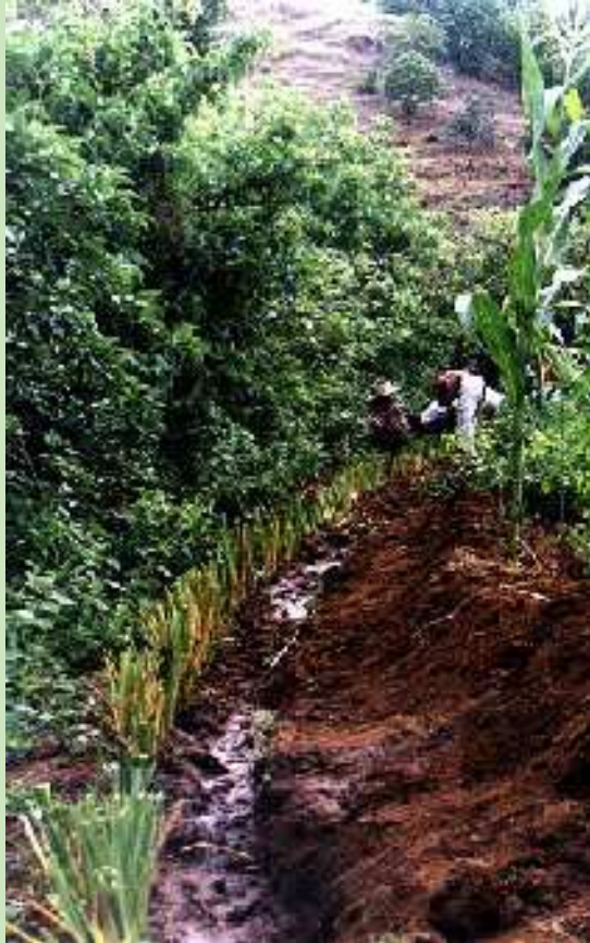
Mexico - Planting by hand