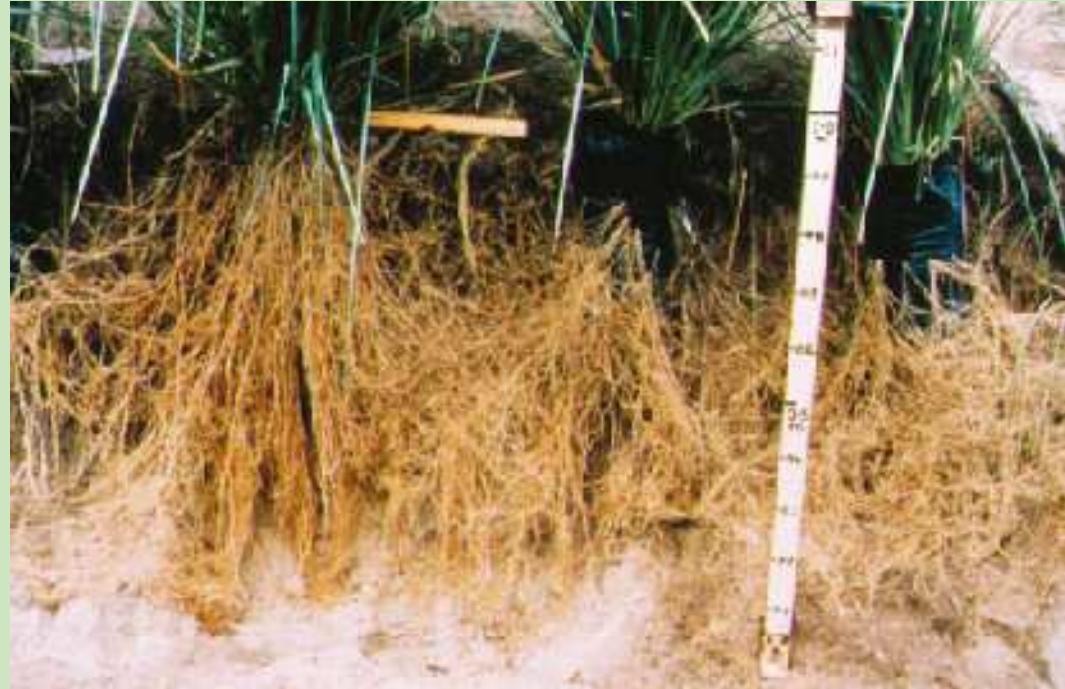
Malaysia - longitudinal section through hedge note the root mass in the top meter of the soil profile