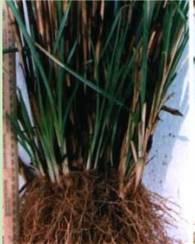
Malaysia - close up Clump grass