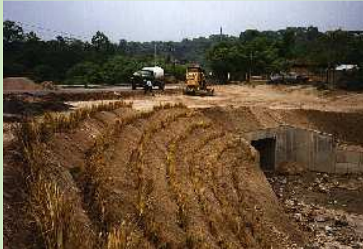
El Salvador - VS for bridge/ culvert protection. Newly planted vetiver hedgerow