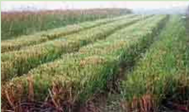
China - 20 ha nursery - bare rooted plants

Vetiver is propagated by root division. If large quantities of plant material are required nurseries need to be established.