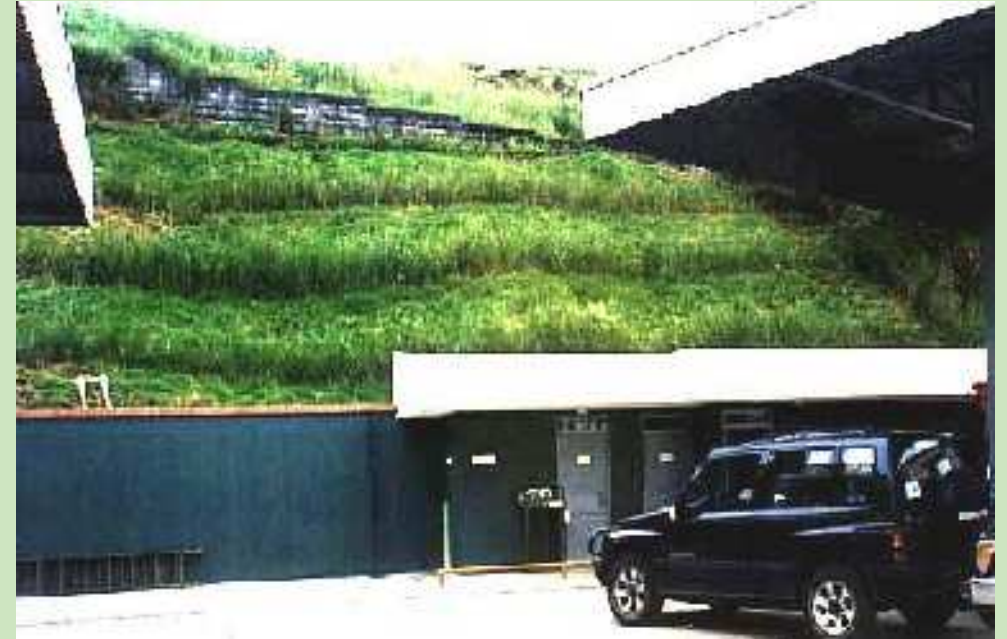
El Salvador - Landscaping and slope stabilization at an urban gas station.