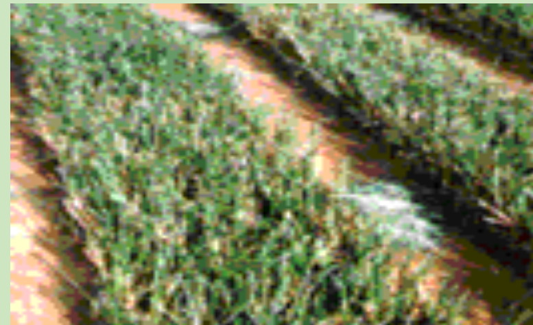
Malaysia - containerized vetiver nursery