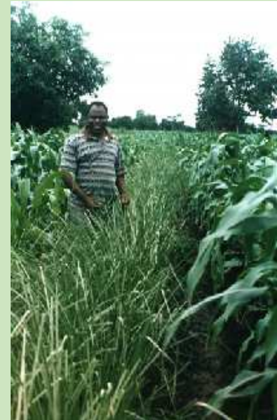
Malawi - Erosion control on maize field