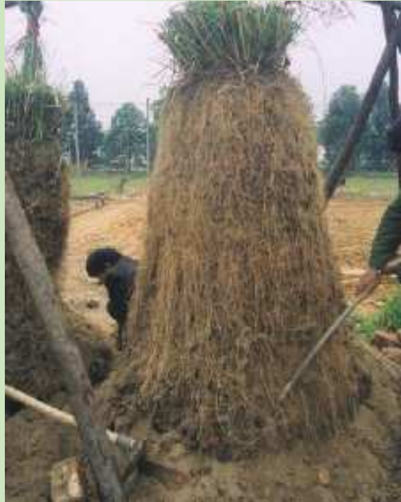
China - excavated root