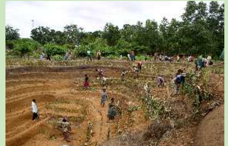
Congo (DRC) - A reshaped urban gully being stabilized with vetiver grass