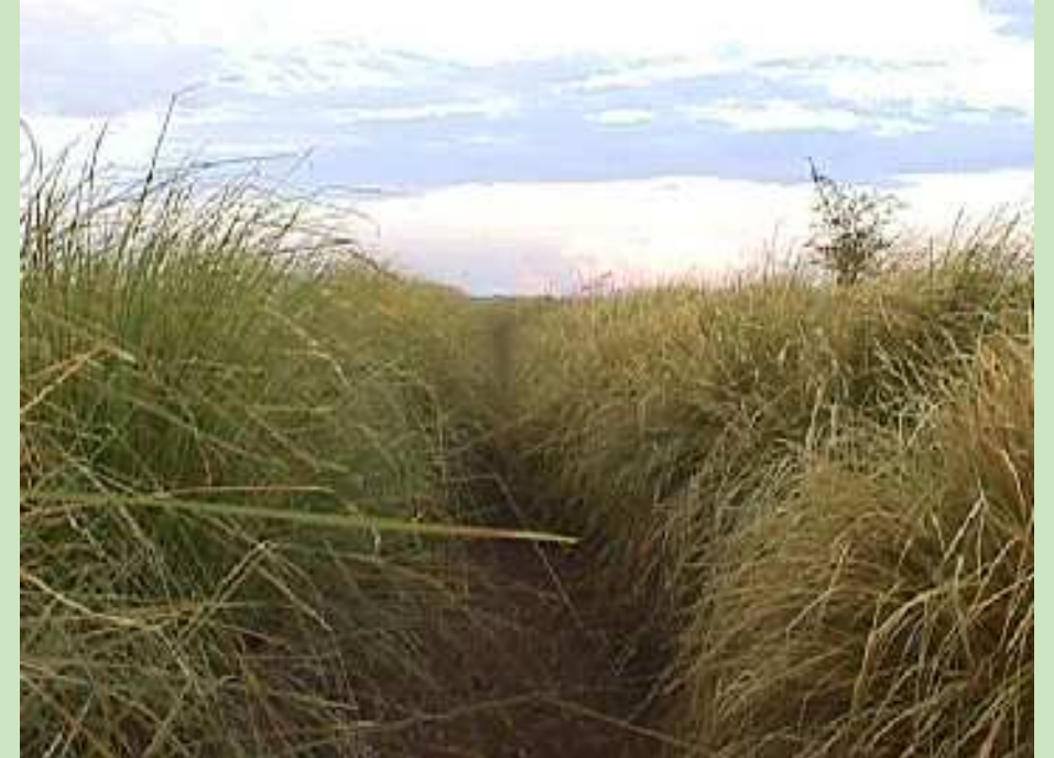
Madagascar - Vetiver stabilizing irrigation canal