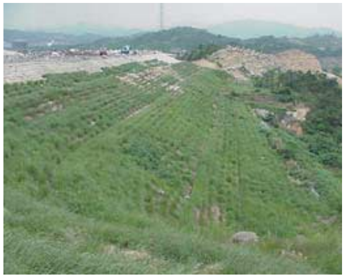
The left and right banks of the Guangzhou Datianshan Garbage Landfill stabilized using the Vetiver System. Prior to planting vetiver no plants could grow on the site. Leachate outflows have been significantly reduced following the application of VS. In one or two places there has been some dieback due to escaping methane gasses. It is possible that an artificial vetiver wetland will be developed at the base of the landfill to clean the remaining leachate flows. VS application was carried out by Guangzhou Rivers Enterprise Co. Ltd. and is being monitored by staff of the Zhongshan University. Other landfills are being stabilized with VS at Zhuhai City located in the south east of Guangdong Province.