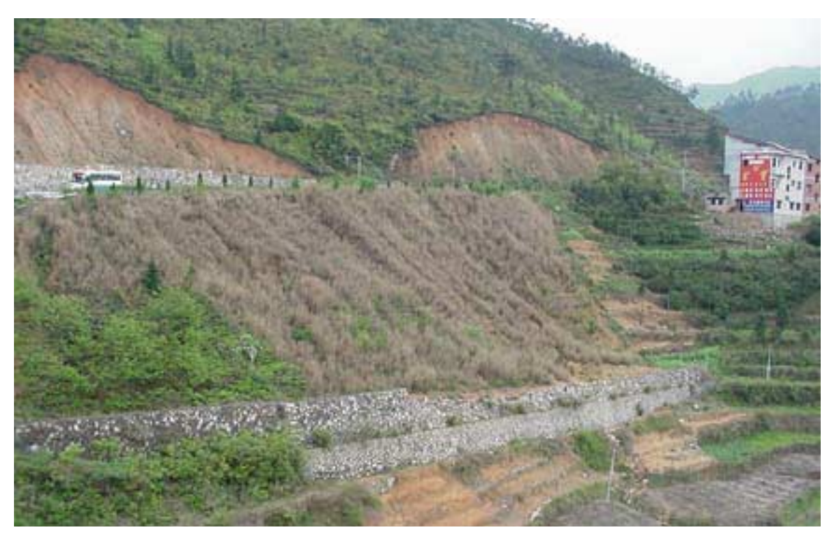
Highway stabilized with vetiver. This is a very large and steep slope with hard measures at the base only. Prior to the planting of vetiver the rock wall at the base of the slope was regularly breached. Note how there has been rilling, but now the slope is stable.