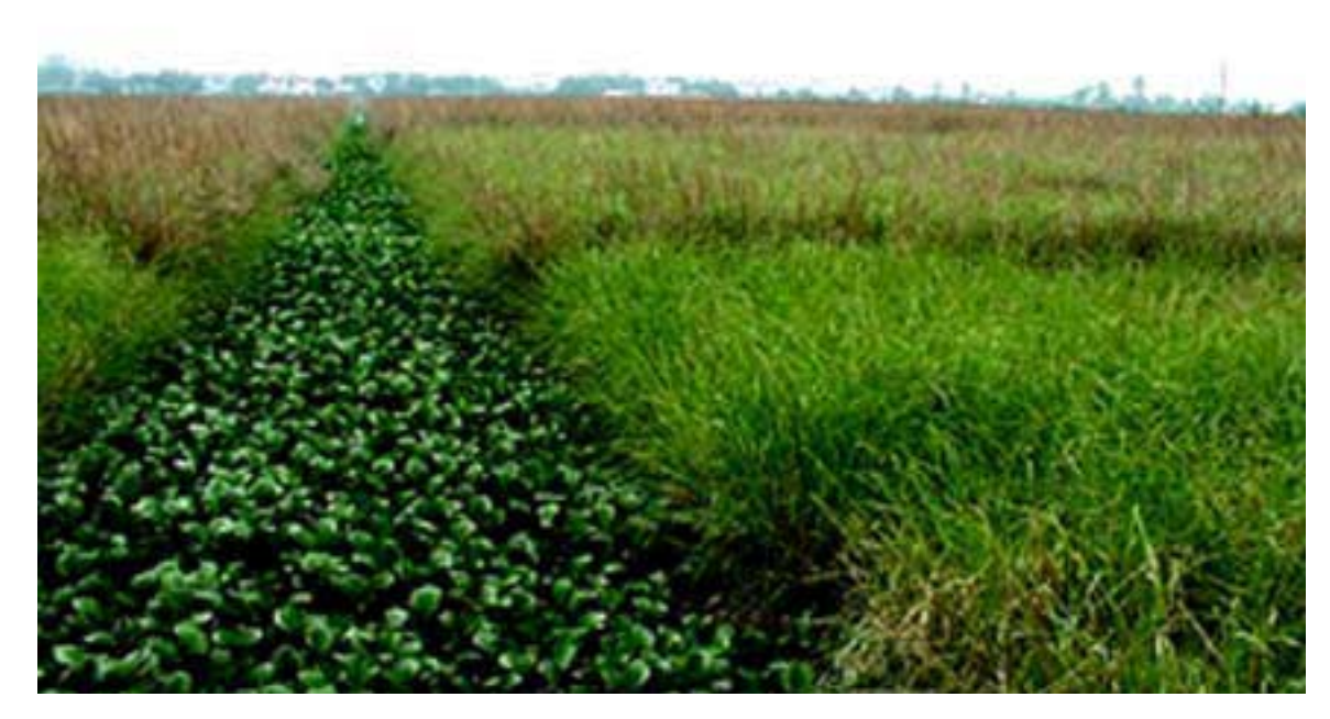
This nursery, owned and operated by Guangdong Huihua Environmental Science and Technology Co. Ltd., is 16 ha and has enough plant material to plant 7,500 linear km of vetiver hedgerows. Most nurseries in China are much smaller between 5 to 10 ha. The size of the nursery underscores the need to have large quantities of plant material available so that contracts can be met on time. This is particularly important where the planting season is limited by winter months and at the height of the wet season when new plantings may be washed away by heavy rains.