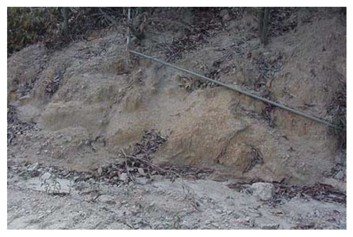
This image is of the slope below an oil storage shed in the quarry. No plants would grow here.