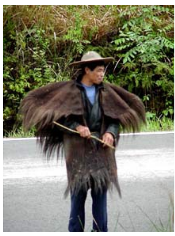
A Se farmer wearing his "raincoat" made of carefully woven palm leaves

has planted vetiver on county, provincial, national roads and on superhighways.