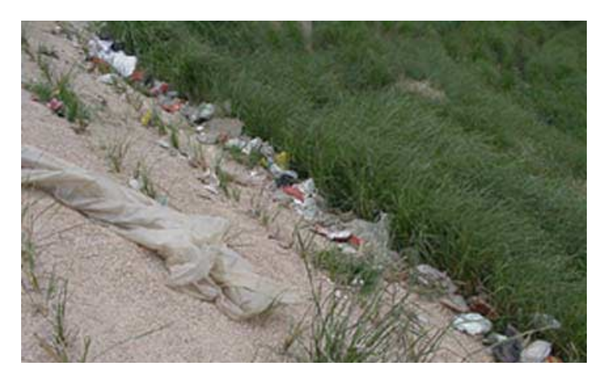
Newly planted vetiver at the landfill. Note the landfill material that the vetiver is growing in.