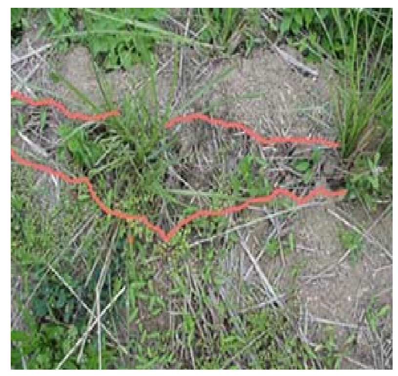
View of vetiver that has been eaten and killed by rats. You can see a darkish empty area between the red lines where vetiver was destroyed. This destruction seems to be of a temporary nature only when adjacent crops have been removed from the fields. It appears that there are no significant economic consequences.