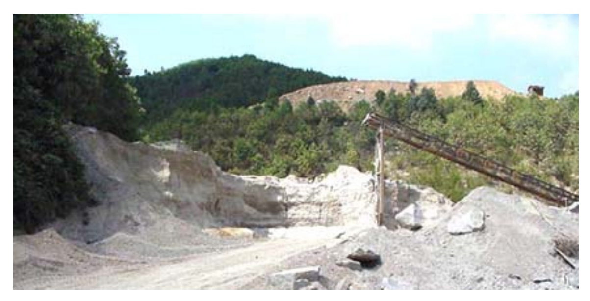
Older plantings at the same quarry. Top image shows mixture of vetiver and native shrubs and tress that have established naturally.