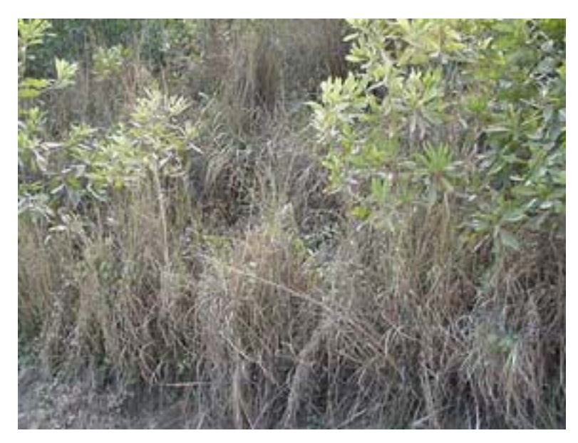
Frontal view of the above site.