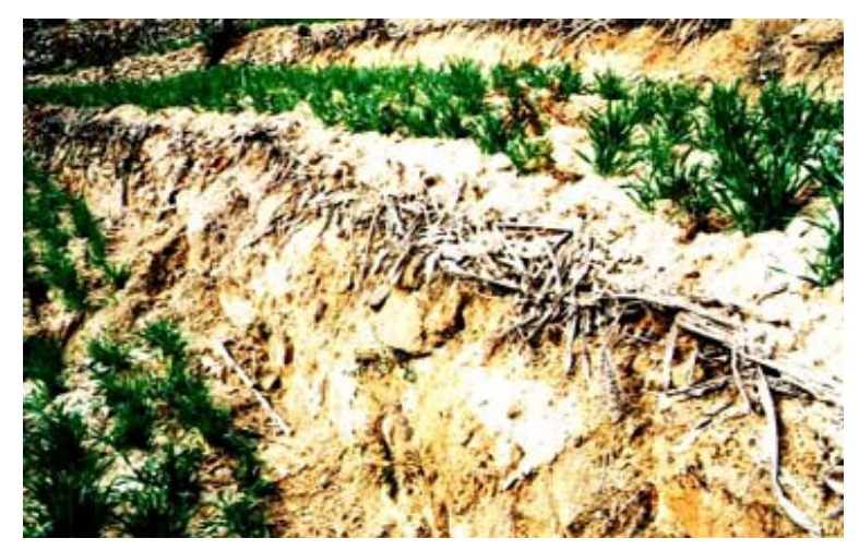
Dabie Mountains: Traditional methods of stabilizing terraces with crop residues -- not very effective.

The Dabie Mountain Project will be the first project that will seriously use VS for soil and water conservation since its pilot application (1988 - 1991) in the World Bank financed Red Soils Project located in Jiangxi and Fujian Provinces. In the intervening years, despite clear evidence from demonstrations and research in south