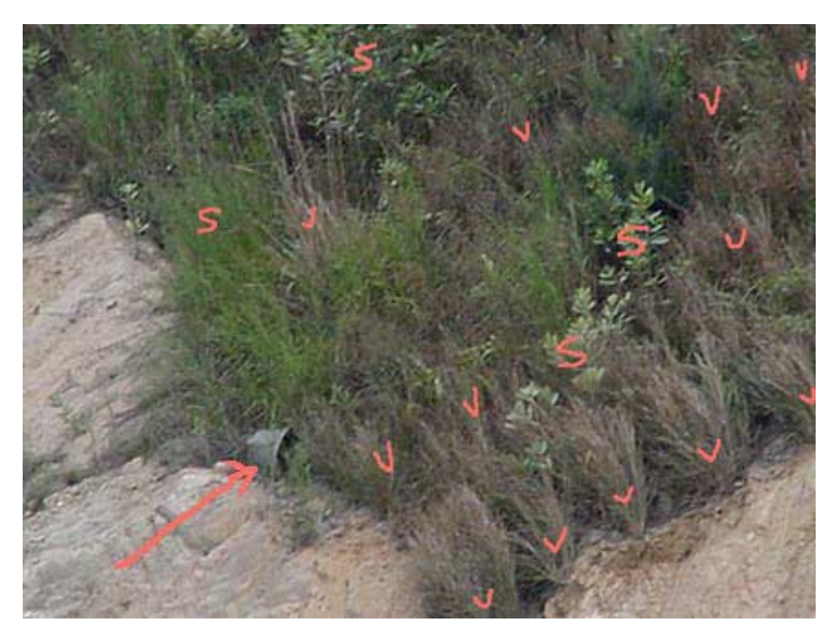
A close up of the bottom part of the top image shows the vetiver (V) and the native shrubs and trees (S) that have established naturally under the pioneer role of vetiver. This vetiver planting is about 1 year old. Vetiver has allowed the native plants to regenerate in the soil and moisture retained by the vetiver.