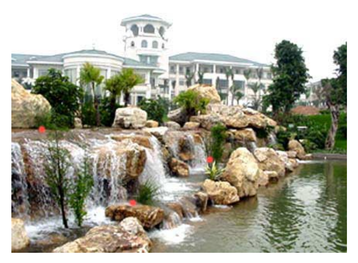
The garden shown in these two images is part of an upscale apartment complex in Guangzhou. In this image vetiver is planted in clay pots and then inserted in this waterfall, again adding greenery and providing contrast to the water and rocks. This work is supported by the South China Agricultural University.

The Chinese are masters of creating natural gardens and vetiver grass is now being used as a lovely ornamental grass. In this example vetiver (marked by red dots) is used alongside the edge of this lake to soften the lawn/lake interface. Because the lake level varies slightly vetiver is an ideal plant for planting in or near water.