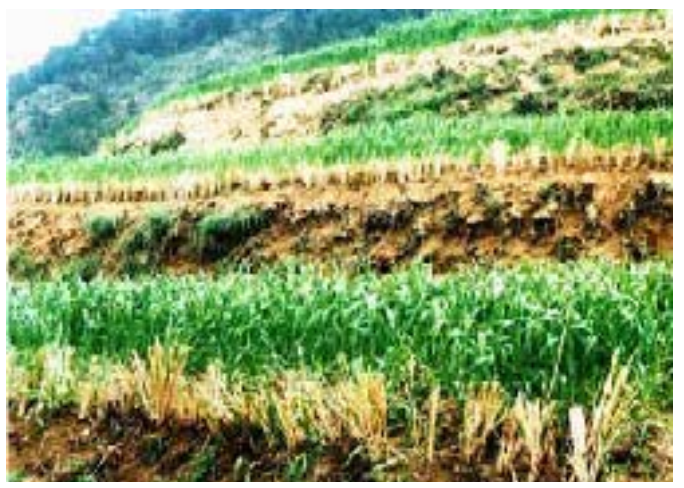
Dabie Mountains: Terraces with newly planted vetiver hedgerows.

China, there has been no interest in VS for soil conservation for two reasons: (a) farmers did not see any immediate direct returns from vetiver, and (b) the methods of teaching and marketing the technology to farmers was inadequate. We hope that CVN's participation in this new venture will be the start of a new effort to use VS for soil and water conservation in China.