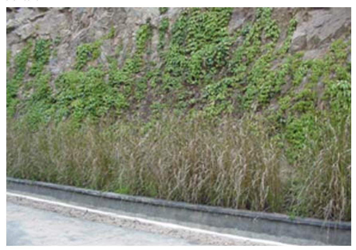
Close up of Climbing Tiger ( Parthenocissus heterophylla . Vetiver hedgerow has captured soil, moisture and nutrients into which the vine was planted. As a result growth is exceptionally good and it is expected that the whole face will be covered within three years. This work was carried out by Guangzhou Rivers Enterprise Co. Ltd. and is an excellent example of the combination of two "soft" technologies

VS used to protect both sides of the county road at Cong Hua. Note how the vetiver hedge planted on the left side of the road at the toe of the slope has prevented soil and rocks from entering the road side drain, Thus reducing maintenance costs. To protect the face of the cut slope a vine/ivy locally known as Climbing Tiger ( Parthenocissus laetiverens ) was planted behind the vetiver.