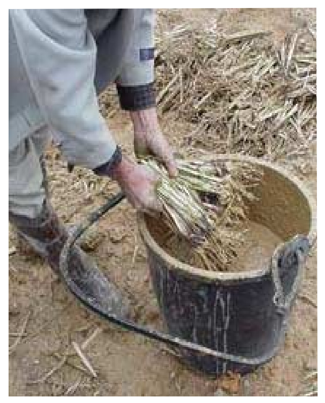
Vetiver slips dipped in a mud slurry prior to planting at the highway site