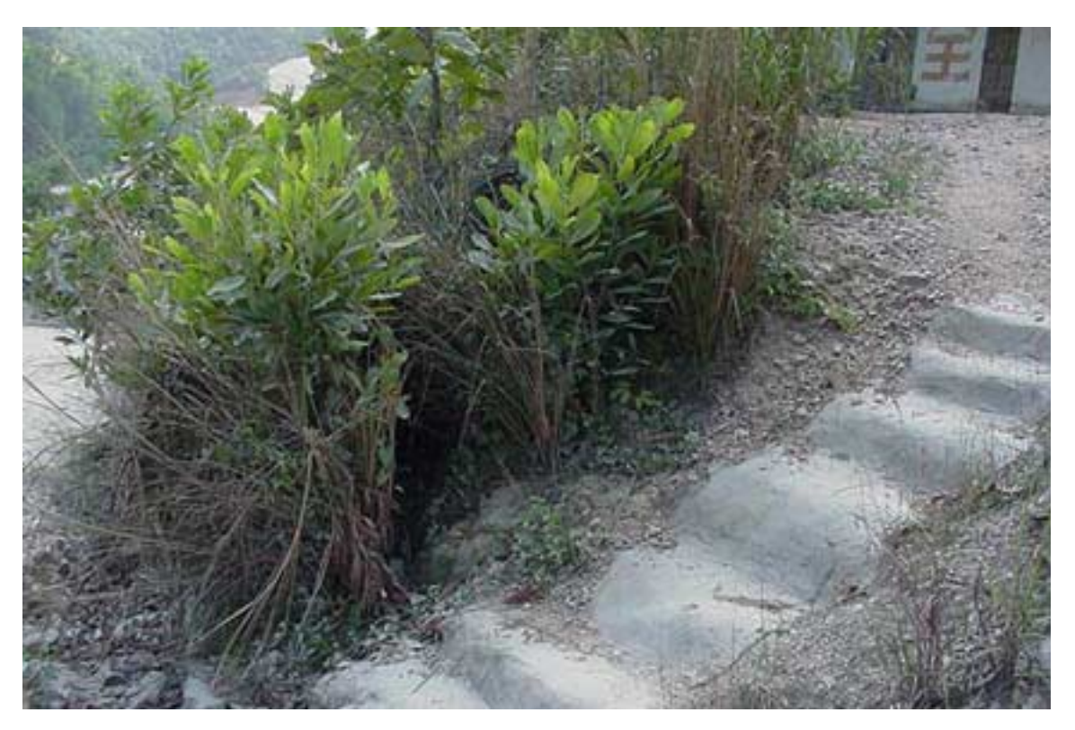
The same site three years after vetiver had been planted -- vetiver well established and native plants are developing. (cross sectional view).