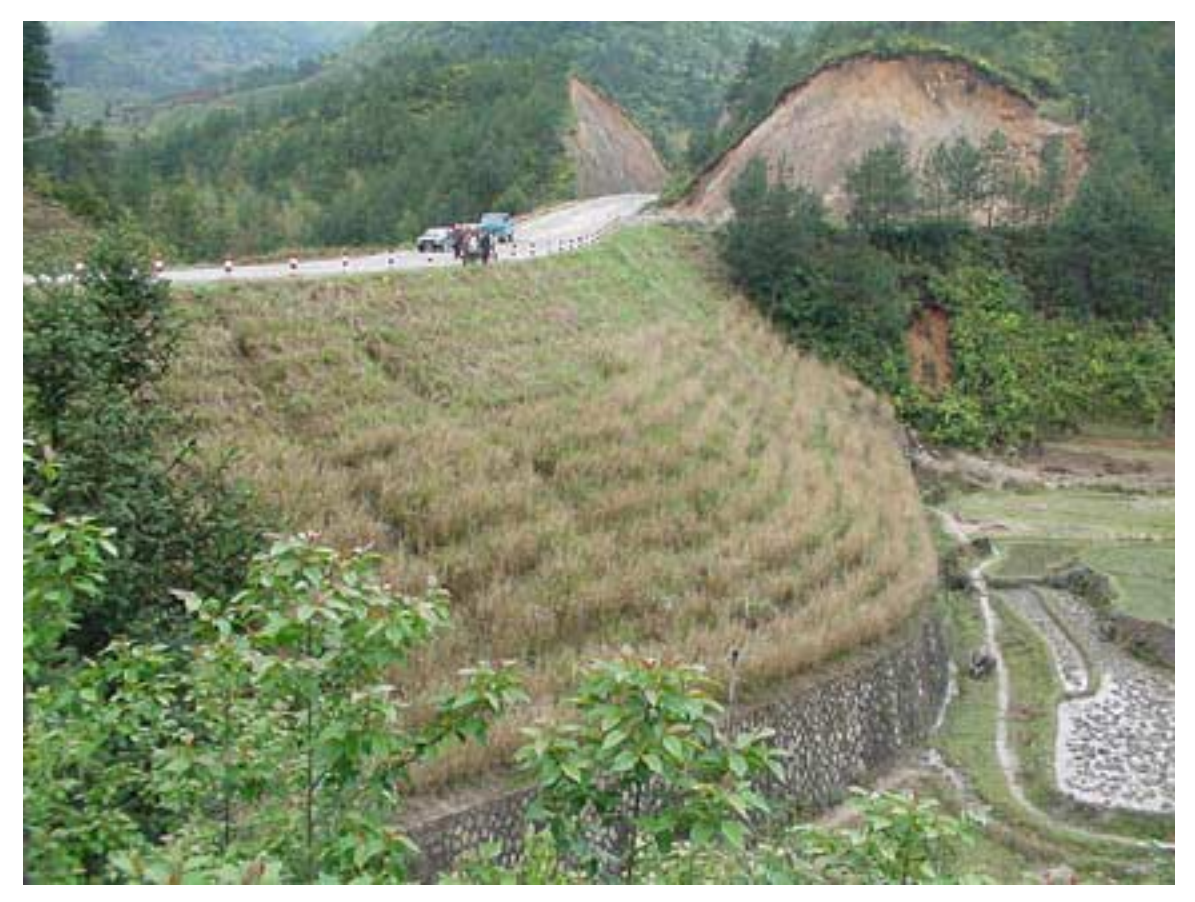
Provincial highway stabilized with vetiver. Planted April 2001. Note the combination of "hard" and "soft" measures. The top few rows of vetiver have been recently cut. There was some rilling on the left hand side but the slope has now stabilized. There remains a management problem.