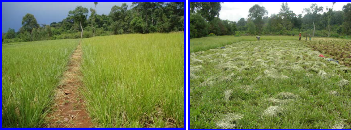
Photo 3. Well managed Vetiver in Sor Nursery ready for planting

advised not to remove from clumps that are not well established and no disturbance is made for clumps that are in field for less than three years.