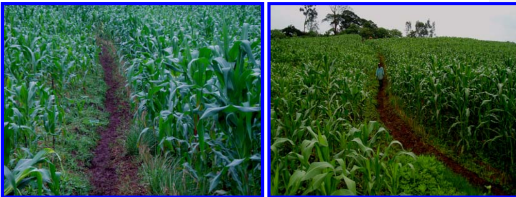
Photo 2. Vetiver planted on Agricultural plots and its impact on the crop (see deep green leaves of Maize)

water conservation activity within the catchment in long term to contribute towards wetland recovery as well. The physical conservation actions were focused around construction of Fanyajju terraces, soil bunds, water ways and cut off drain in order to reduce runoff from the upslope and halt soil and water erosion and increase water infiltration within the catchment. Further this action was sought to arrest water loss from the upslope mainly from the agricultural lands and conserve the water with the soil system and increase the water level within the wetland system through infiltration and underground water table recharging. As most of the land use within the micro watershed was dominated with cultivated land for cropping it was crucial to embark on the construction of conservation structures. Further tree planting and agro-forestry practices were undertaken in order to reduce the erosion level and halt soil degradation within the micro watershed. Over the project life, 820 kilometers of Fanya juu, 70.80 kms of soil bund, 4.65 kilometers of waterway, and 25.5 kilometers of cut-off drain were constructed within Wichi Micro Watershed over 1018 hectares.