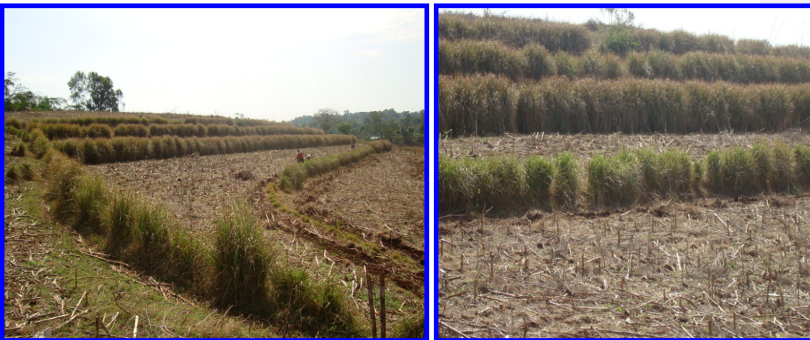
Photo 4. Well established Vetiver in agricultural field – Wichi Metu