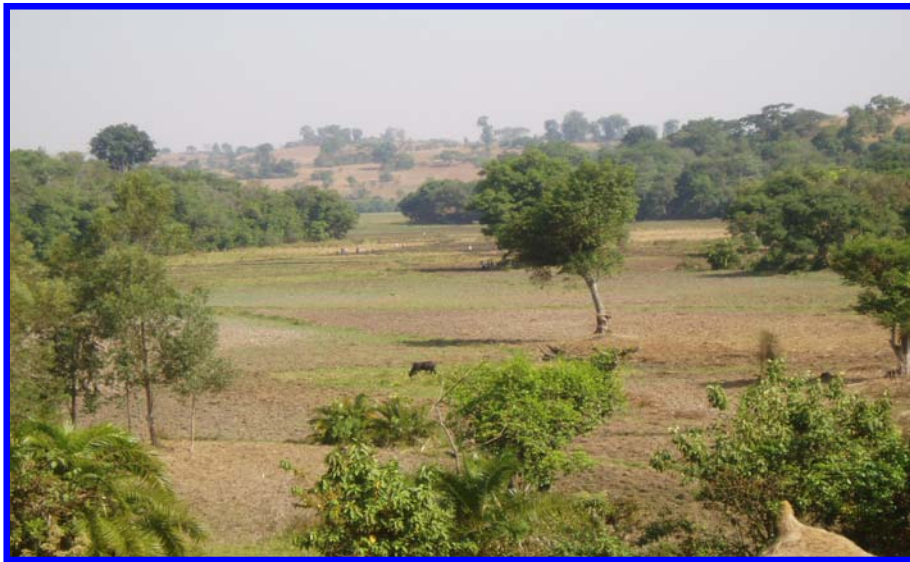
Photo 1. Partial View of Wichi Wetland and Micro watershed

The information provided here is totally the outcome from the abovementioned project intervention and based on the project reports, discussions made with local residence of the micro watershed who are the direct beneficiaries from the project intervention, field observation, as well with staff from Metu Woreda Agricultural and Rural Development Office and impact monitoring report.