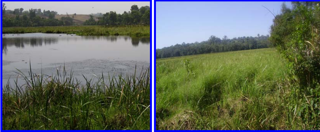
Photo 6. Water birds and the flourishing flora community as indicators of biodiversity recovery in the Wichi wetland