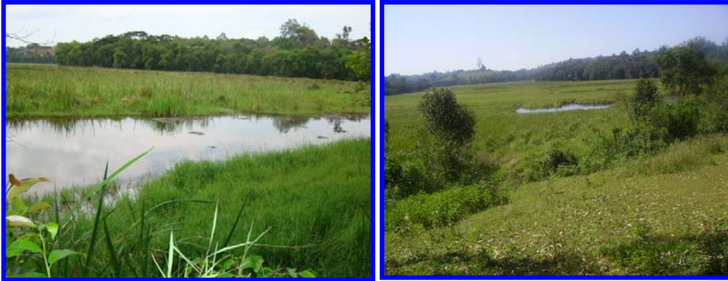
Photo 5. Wichi wetland with full of water at the end of the dry season