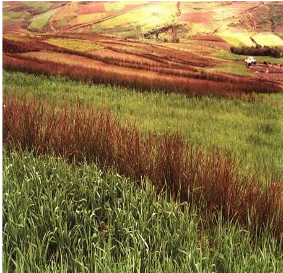
Vetiver Grass Contour Hedges