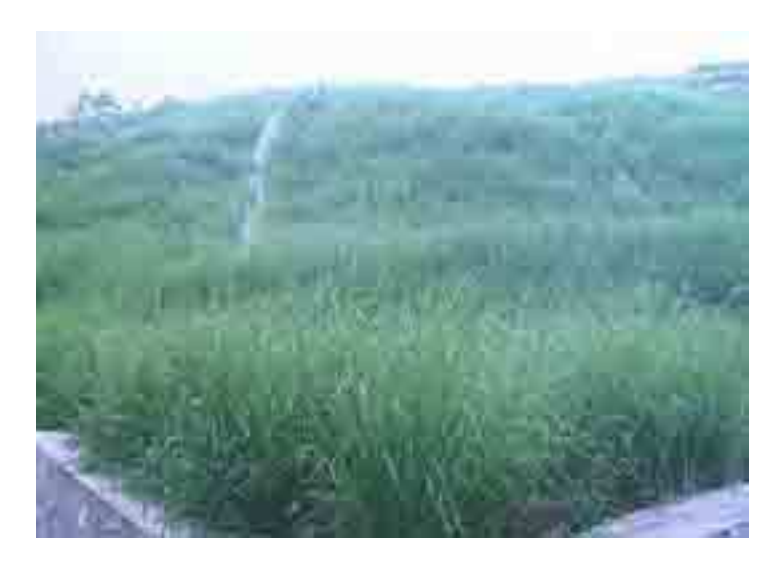
Huge highway cut was fixed by vetiver (elephant grass failed before)