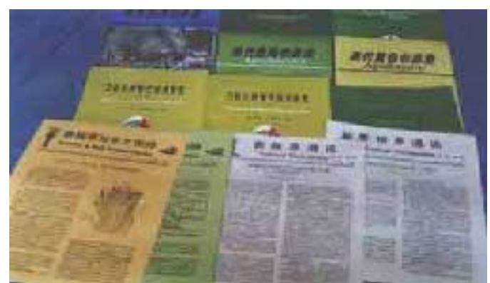
Multiple publications for different users