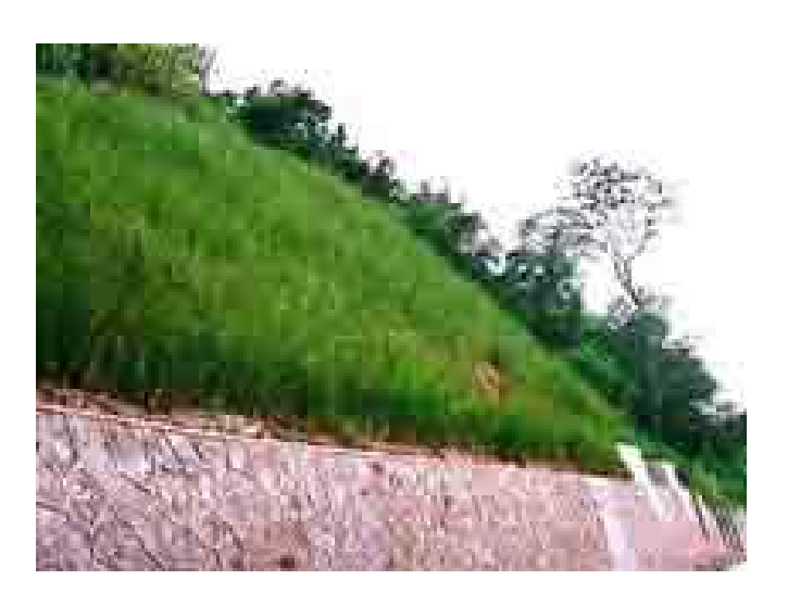
Slope stabilization (above and opposit are all buildings)